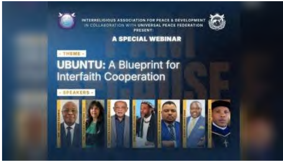
Ubuntu: A Blueprint for Interfaith Cooperation