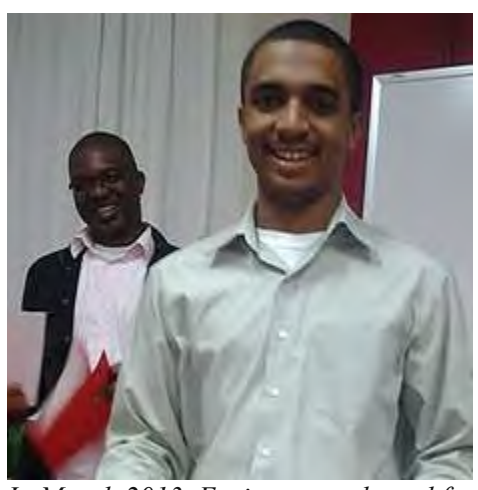
In March 2013, Espinosa graduated from "Micro Church," a small group at 4 West 43rd Street in New York that cultivates future pastors.

Within my own family, I am persecuted or cursed at if I want to serve them. I ask my mother to allow me to wash the dishes. Sometimes I have to insist because she simply will not let me do it. So, she and my aunt whom I love curse at me for wanting to serve and assist them although they say they can do it on their own. These reactions make my heart feel heavy, and I sometimes I think, "Why should I try if they are just going to reject my love?" But then I remember that these are the kind of things that I have to deal with as I persevere as the first generation of my family.