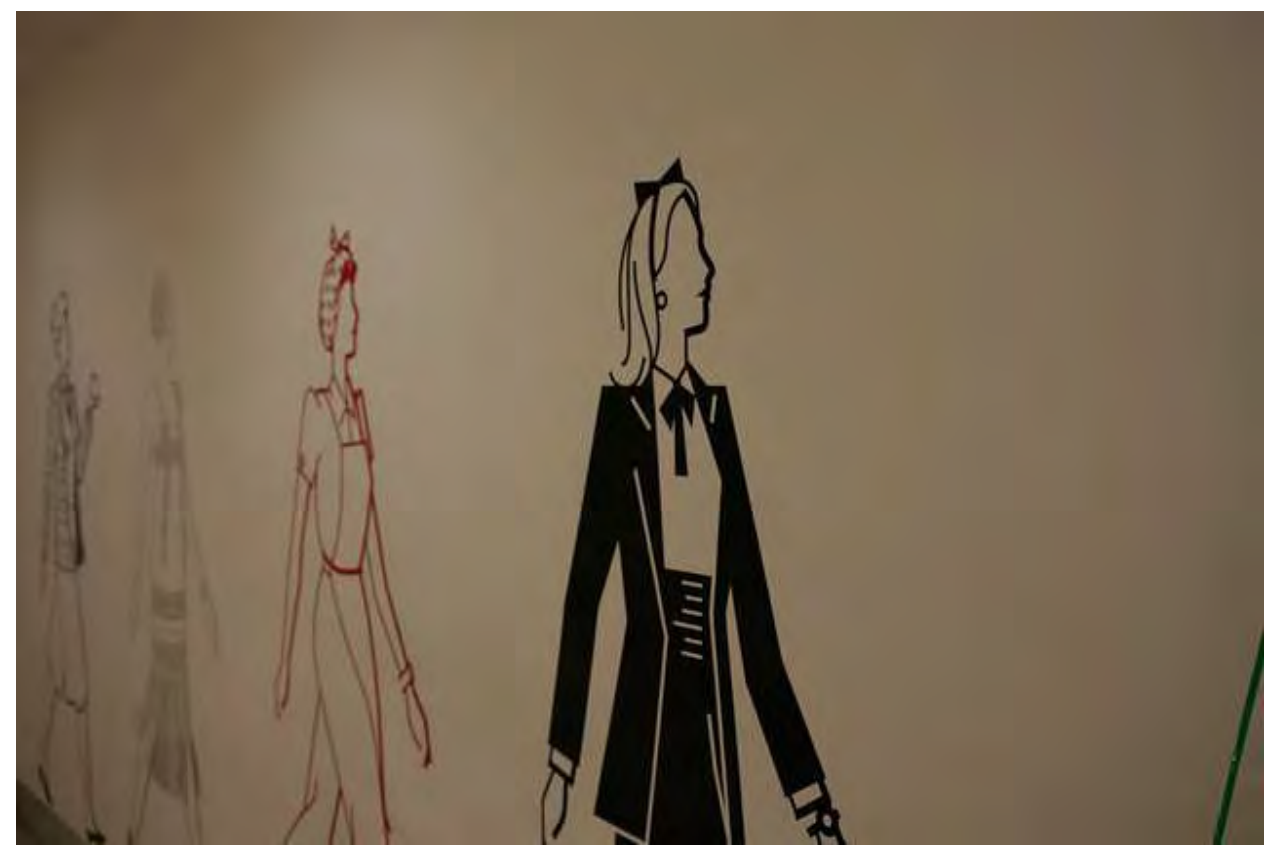
"Investing in women is not only the right thing to do. It is the smart thing to do. I am deeply convinced that, in women, the world has at its disposal, the most significant and yet largely untapped potential for development and peace." – Ban Ki Moon, UN Secretary General on International Women's Day (2008)

A feminine approach to leadership is traditionally a compassionate one, an empathetic one, a soft one – all of which reflect CARP's Unification Principles which seek to bring about unity in every circumstance. Soft skills such as communication, empathy, creativity, and intuition are essential in developing the emotional intelligence quotient (EQ).