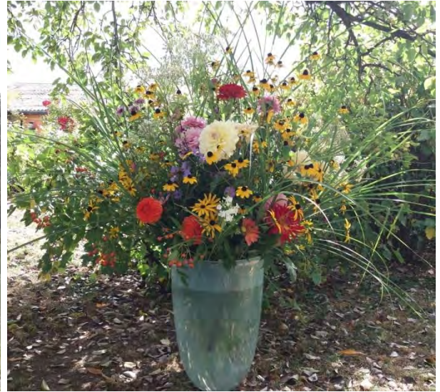
Garden party at the home of the Pries in Bleckede