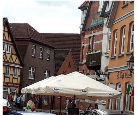
Impressions of „Michaelshof“ in Sammatz