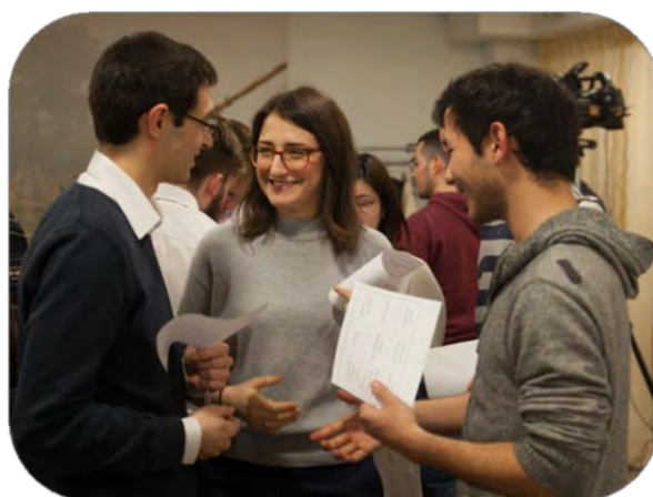
Participants getting to know each other during the first evening.