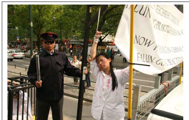
Freedom of religion suppressed: From Falun Dafa parade in Berlin in 2007, portraying persecution of Falun Gong members in China

After the incident [Editor's note: the assassination of former prime minister Shinzo Abe] in July 2022, there was a surge of negative media coverage about the Family Federation . I felt frustrated that the true nature of our church was not being conveyed, leading to misunderstandings. I also saw my children being hurt and confused by the changes in society's attitude toward the Family Federation . Every day, I thought about how I could protect my children and how I could defend the Family Federation .