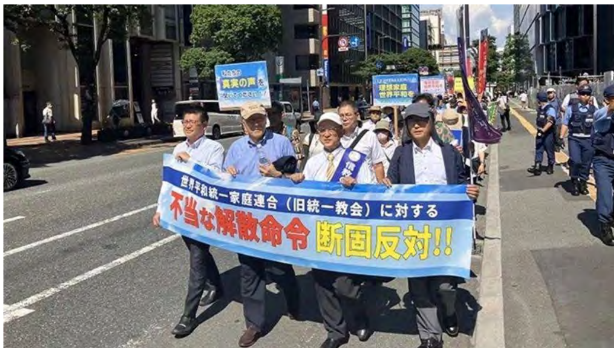
Participants in a demonstration march near Fukuoka City Hall under the scorching sun on the afternoon of the 4th August 2024, Fukuoka City, Fukuoka Prefecture

Protection of Freedom of Religion" is something that people around me commend. But for me, I'm standing there desperately to protect something important.