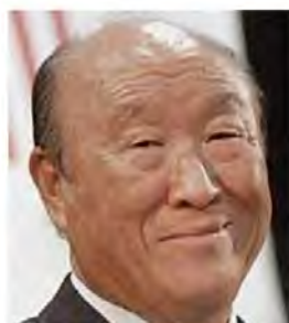
Father Moon . Photo:

"Why do we marry? It is to resemble the image of God . God is a being with dual characteristics, possessing both an invisible male nature and an invisible female nature. In one body with dual characteristics, these characteristics are in complete harmony and unity. God is