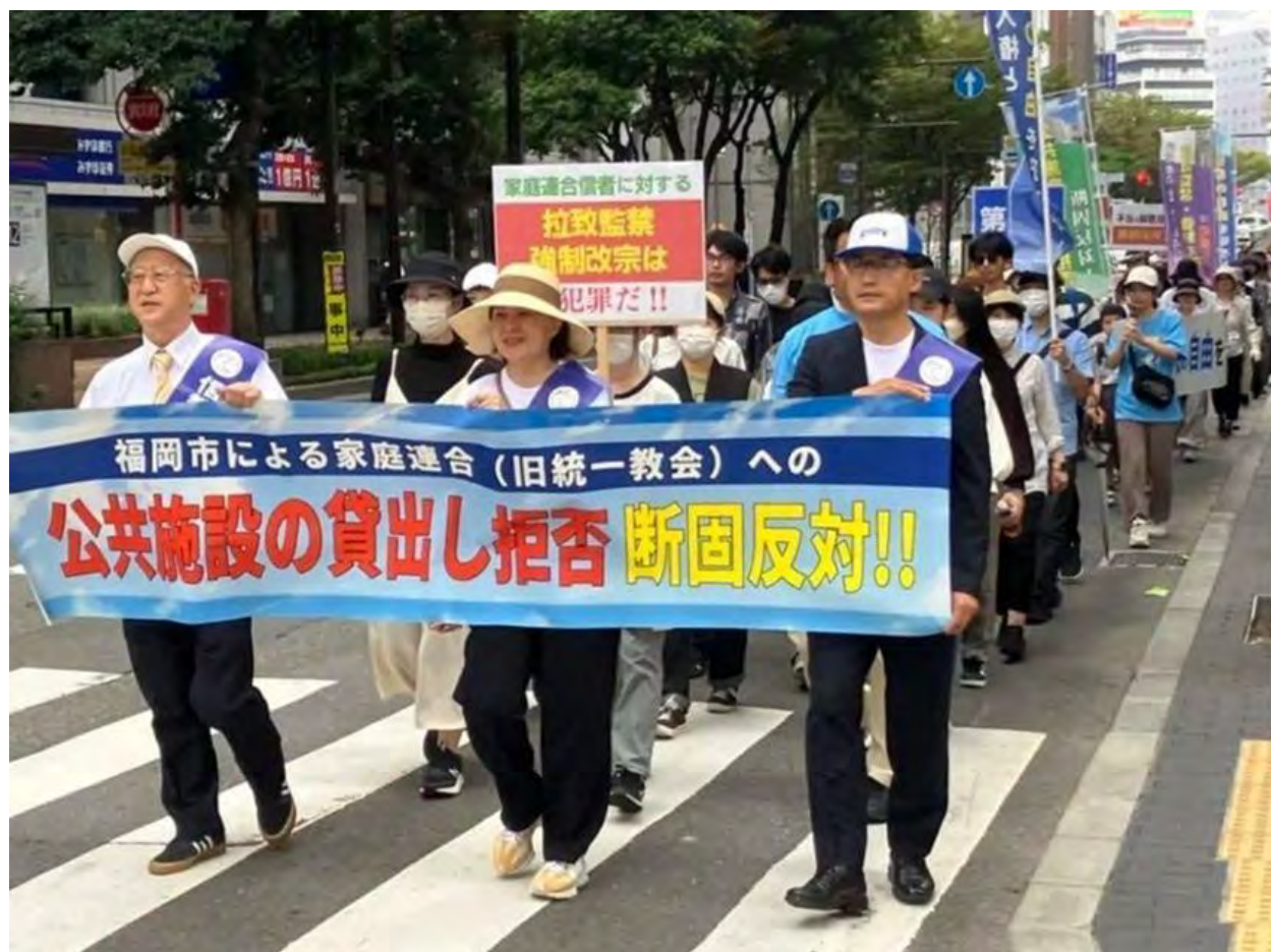
Participants in the demonstration that started in front of Fukuoka City Hall and marched through the downtown area of Fukuoka City, on the southern Japanese island of Kyushu on 6th October 2024

Question: Thank you very much. One more question, please. The issue of "second-generation religious members" has become a social issue, particularly concerning conflicts over passing on faith to children. How do you approach this with your own children?