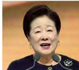
Mother Moon 4th Feb. 2020.

"We must now change how we address God . When we pray, we will change [the Korean word] 'Hananim' to [the Korean expression] 'Haneul Bumonim'. This is 'Heavenly Parent'. It is smooth in English and is also meaningful in Korean. Therefore, when you pray, the very first words you utter should be 'Heavenly Parent' [...]. (Speech by Mother Moon 7 th January 2013 in Gapyeong, South Korea)