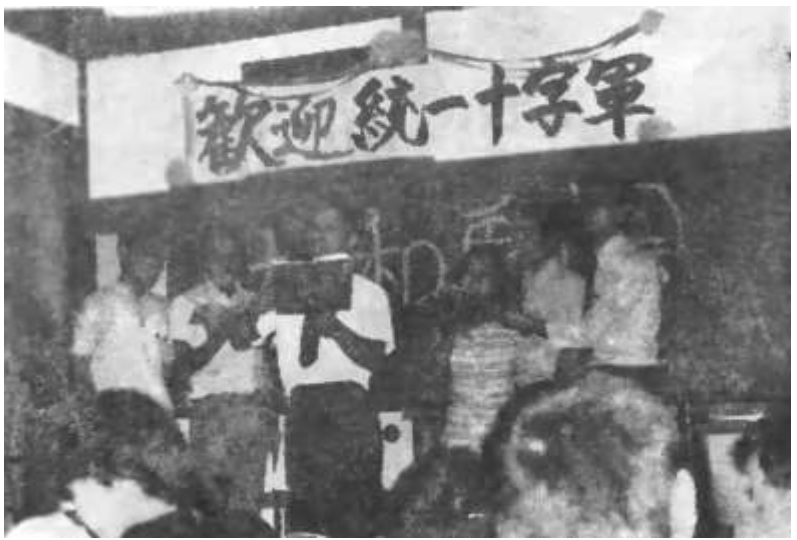
Forty for new Japanese Crusade members at end of training session

Thus, today also at companies, at homes and on the street: side, brothers and sisters are selling and selling, firmly believing that the Performance will succeed and that one ticket means a passport to Heaven for the person who buys it, because they know that the Little Angels is one of the fruits of our Master's Heart.