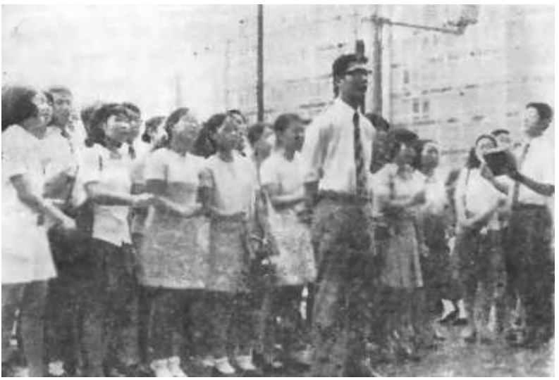
Japanese Crusade members appeal to the people's hearts with Family songs

One World Crusade in Japan was established by our Master when he visited Japan in May. In the beginning, the number of the Crusade units was 14 and of the Crusade members was 600. But this time Master ordered to increase the number of the Crusade units to 51. So, now in Japan we have one Crusade unit in each district and are making efforts to have 2,000 Crusade members to fill the pressing need. Master ordered each Crusade member to witness and bring forth one family member in one month. So they are now witnessing, witnessing and witnessing day after day with great fervor.