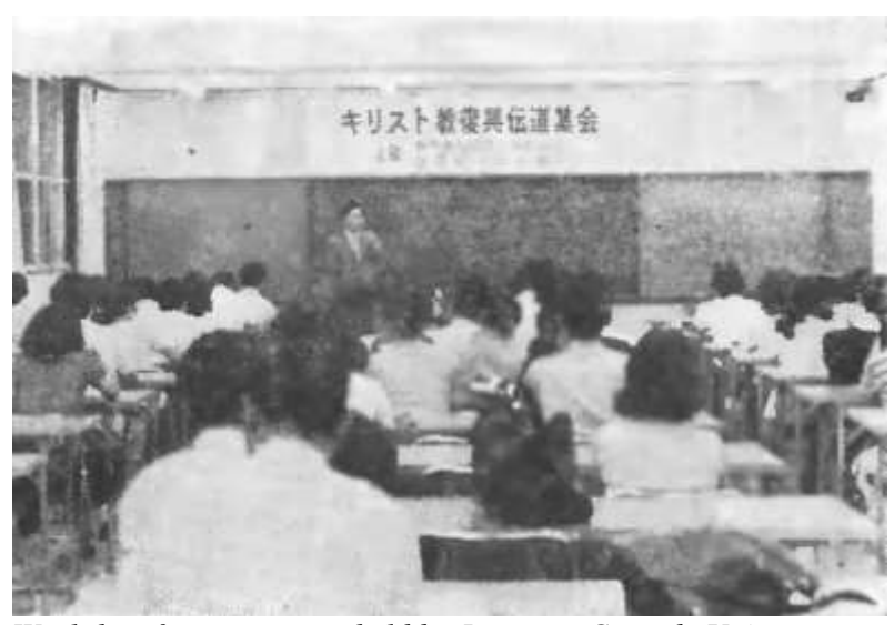
Workshop for newcomers held by Japanese Crusade Unit

Thus One World Crusade in Japan is now progressing step by step with great power. We believe that every soul in Japan will be awakened by this bold Crusade based on our Heavenly Father's Heart.