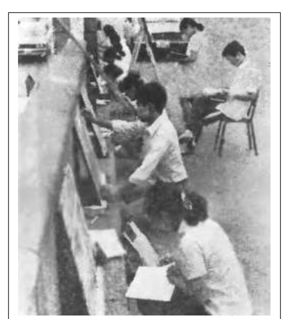
Japanese Crusade members practice their Principle lectures on the street-side.

The year 1972 has now come to the last stage in this extremely strained situation all through the world. Especially in Japan the political situation is very chaotic and we, Japanese family, are now fighting against the Satanic power which schemes to lead this country to the decisive fall. We are poor and have nothing, but are firmly determined to do our best with prayer to perform God's wish which should be fulfilled soon in Japan. Concretely, we Japanese family are now working mainly for the Victory Over Communism Movement, the Little Angels' Performance and the One World Crusade.