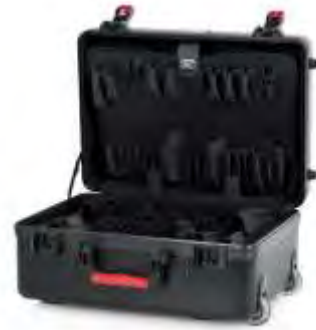
(Something Like This)