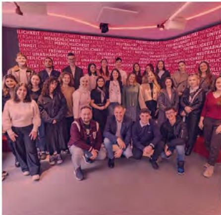
Learning from the Best Inspiring Visit to the Austrian Red Cross