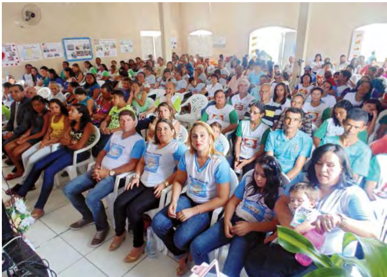
A Home Group Conference

We are doing home group work with this type of process, which can develop each individual's skills so that he or she can flourish as a heavenly tribal messiah. For all our members to be effective in heavenly tribal messiah work, as True Parents have shown us, they must establish a foundation of three disciples and then twelve disciples of their own and love each one of them.