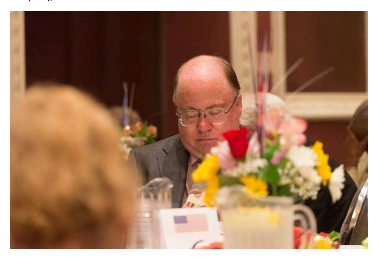
Friday, July 25, 2014 at 11:56am UTC+09

Tomorrow we begin with morning prayer on the beach at Lake Michigan and hold the prayer at the Indiana Holy Ground. https://ffwpu.org/us/usa-holy-ground-pilgrimage-and-revival-tour/hammond-indiana-32165-1637/