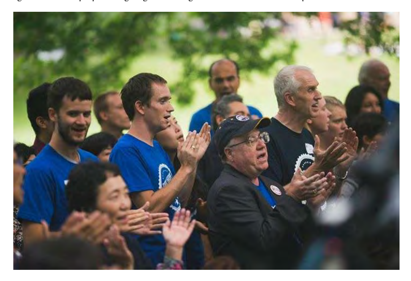
Tuesday, July 29, 2014 at 8:15am UTC+09

part of the celebration that stands out in my mind was the testimonies of the acts of restoring the sins against the native peoples and giving the blessing to the tribes who still live in quite miserable conditions.