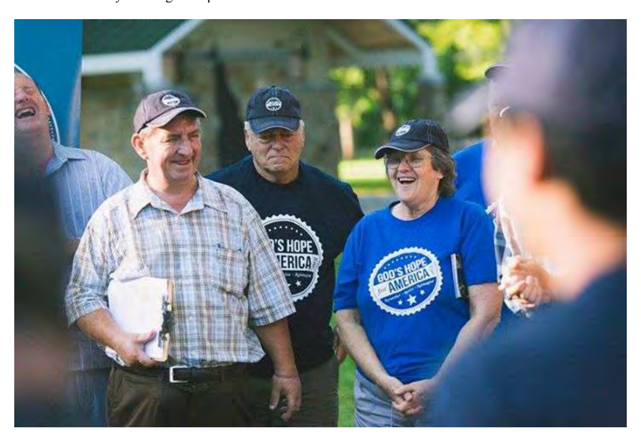
Tuesday, July 22, 2014 at 9:10am UTC+09

retracing his steps are going slower, have luggage, good food and hotels to sleep in. But our spirit is high. This is the last Holy Ground in New England and we had guests from as far away as Canada. One young man I met told me he was recently saved asked me what he could do. I suggested he ask his church to pray for America because if America fails, the world will suffer greatly. I hope we can inspire the Churches of America to pray to be God's Hope for America. After having lunch together in the park we moved on to Barrytown. #godshopeforamerica