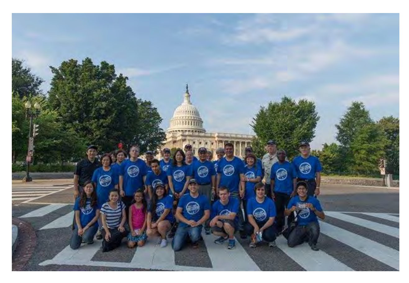
Friday, July 18, 2014 at 12:46pm UTC+09