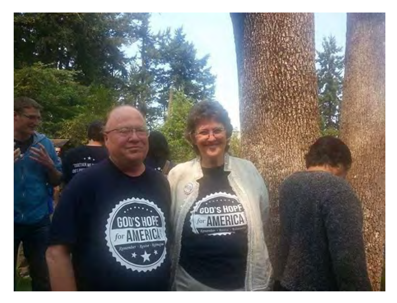
Monday, July 21, 2014 at 12:52pm UTC+09

Tomorrow the bus turns west: https://ffwpu.org/us/usa-holy-ground-pilgrimage-and-revival-tour/brattleboro-vermont-32065-1630/