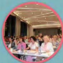
GLOBAL WOMEN'S PEACE NETWORK