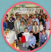
HEALING AND RECONCILIATION