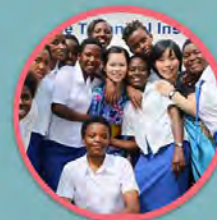
HUMANITARIAN AND COMMUNITY PROJECTS