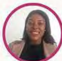
PROF.ª MARCIA POSSO Mozambique