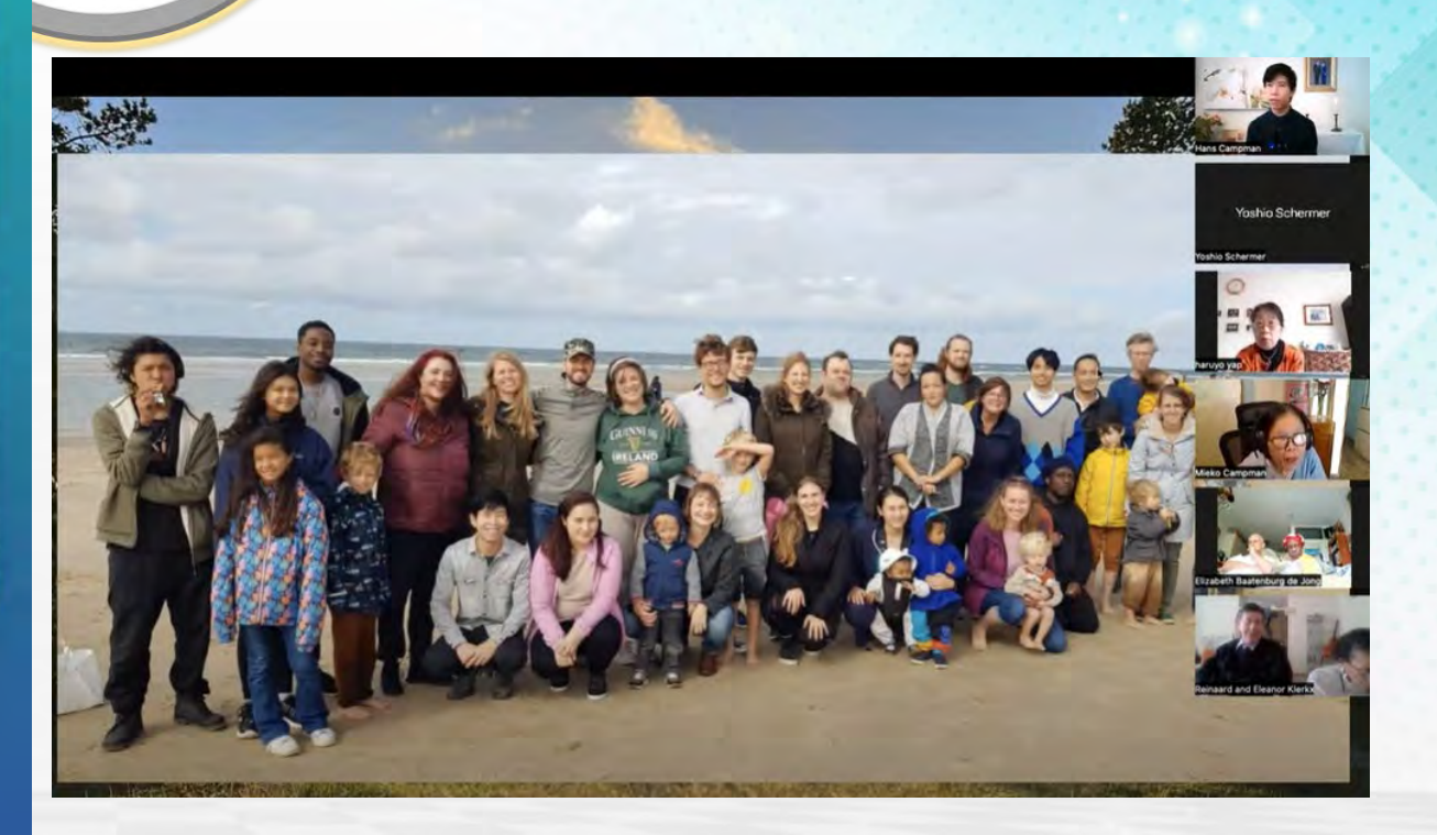
Young adult workshop