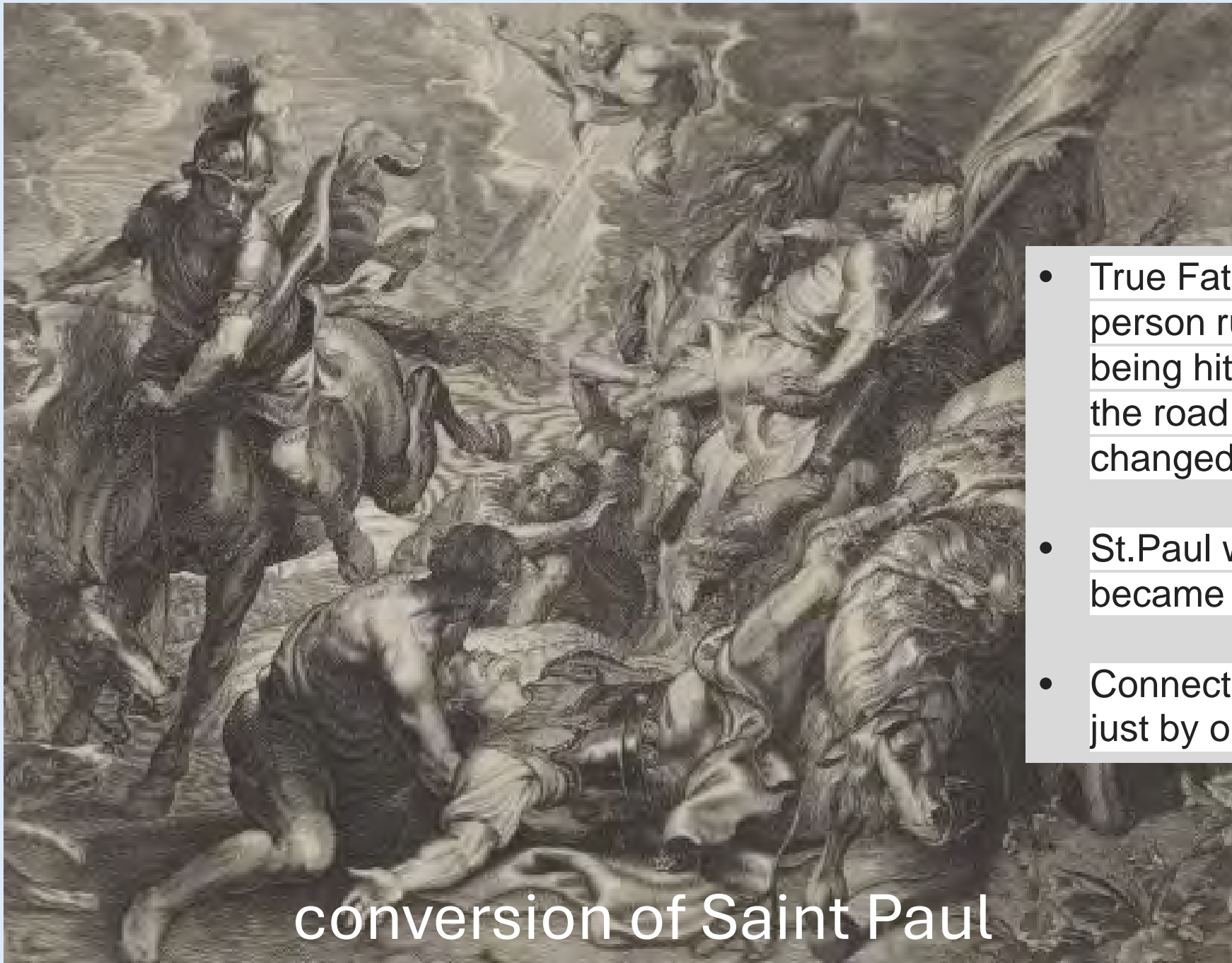
conversion of Saint Paul