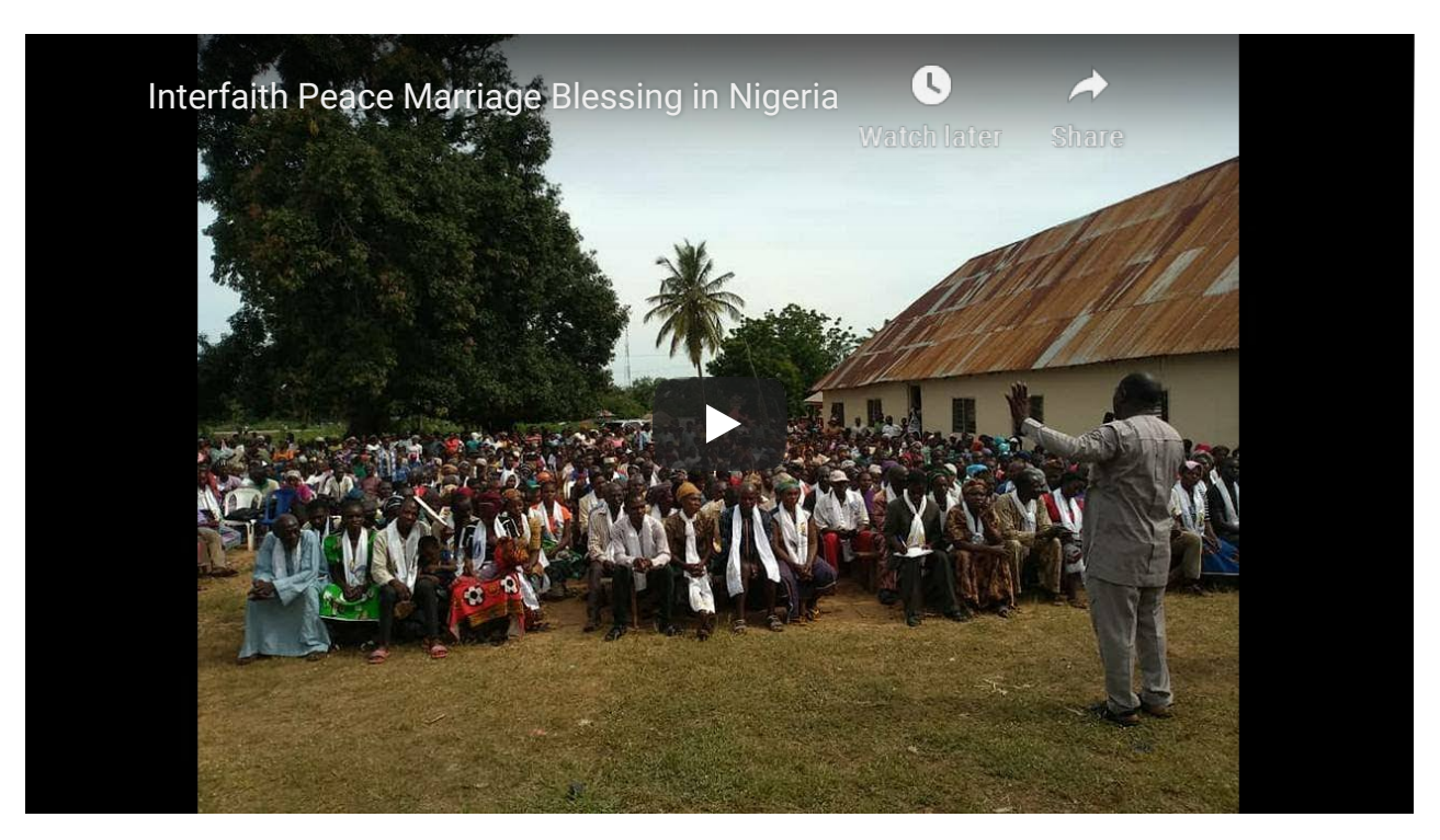
This video is played at all the Workshops for Christian Ministers in Nigeria