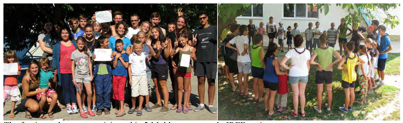
The foreign volunteers participated in 2 Moldovan quarterly IRFF projects:

Fifteen volunteers from Italy stayed in Moldova in August 9-17. Their purpose was to learn more about the "Long Distance Adoption" project organized by IRFF ONLUS of Moldova in collaboration with the Italian IRFF.