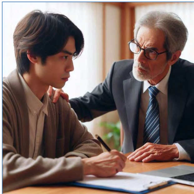
Attempted faith-breaking illustrated