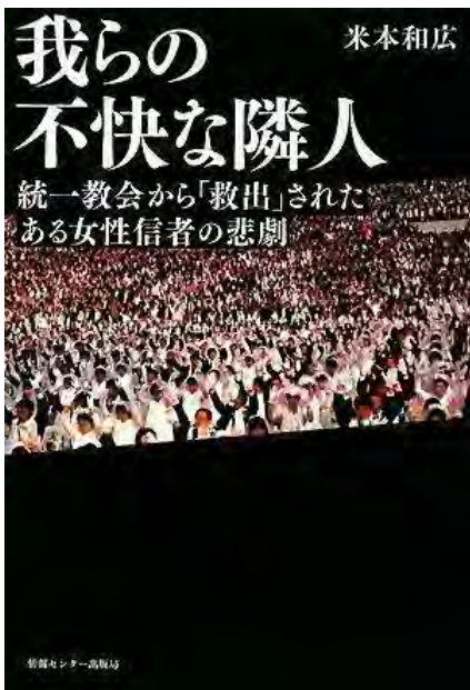
The front cover page of "Our Unpleasant Neighbour: The Tragedy of the 'Rescue' of a Female Believer from the Unification Church " by Kazuhiro Yonemoto (2008)

Then, just after that, I read a little about Toru Goto (後藤 徹) and the issue of abduction and detention in "Our Unpleasant Neighbour" (我らの不快な隣人) written by Kazuhiro Yonemoto (米本 和弘). So I was a little aware that it was members of the former Unification Church who had been abducted and detained.