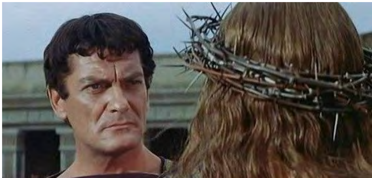
Scene from the Italian film Ponzio Pilato [ Pontius Pilate ] (1962)

Investigative journalist on current state persecution: "In the future Fumio Kishida might be seen as a figure like Pontius Pilate."