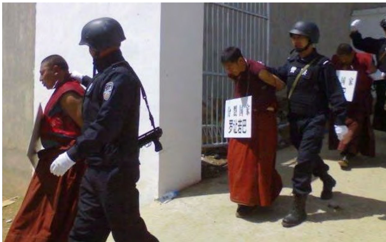
Persecution in China: Tibetan Monks arrested in 2008

persecuted in Russia and China. Of course, this is very bad. I know a little about China and Russia. In Russia, I once heard a very sad nurse who is a Jehovah's Witness say that Putin is persecuting them. This is indeed a very serious situation. However, in Japan's case, Japan is recognized in the world as a member of the G7, an advanced democratic country where religious freedom is fully recognized.