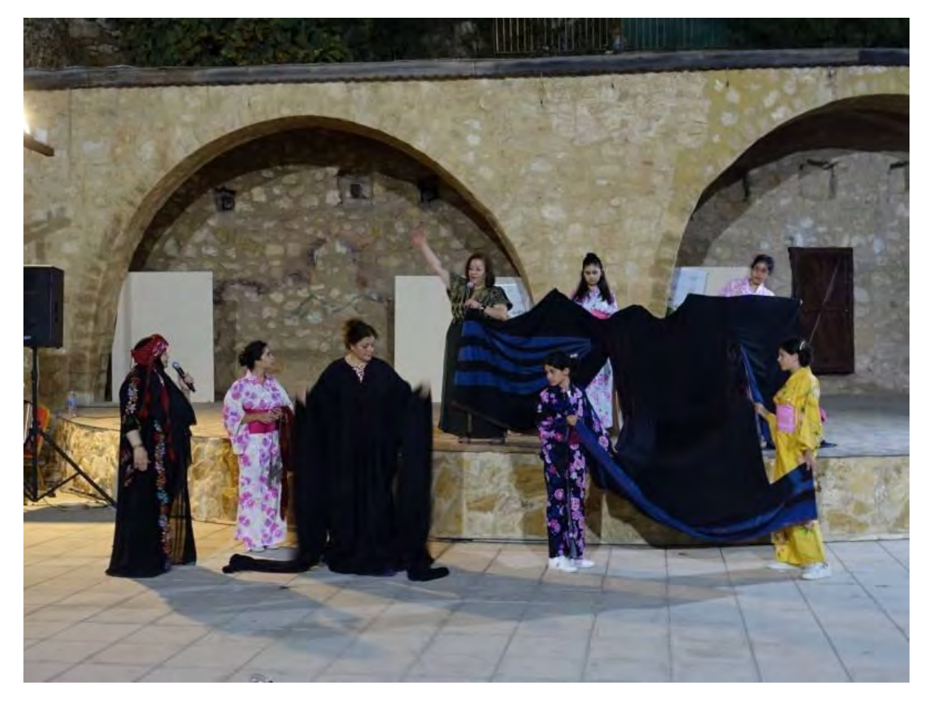
From September 1 to 9, a group of young Japanese WFWP members accompanied the organization's