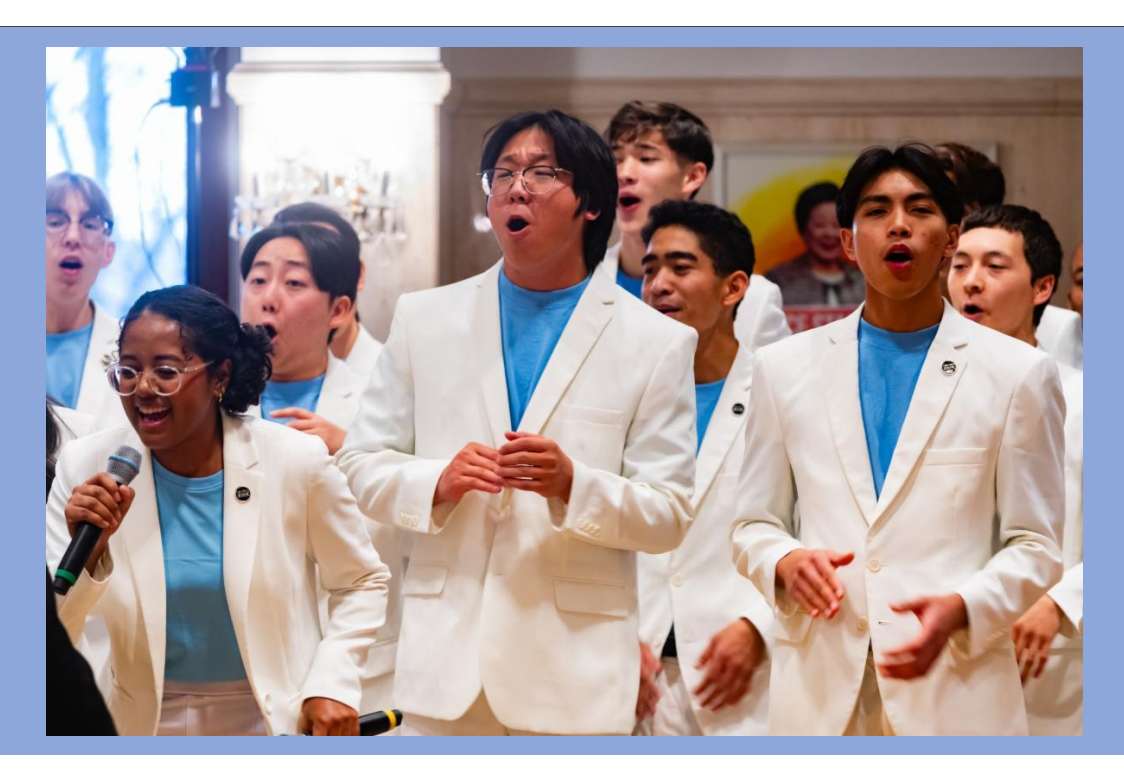
Select the picture above to watch HUSA's performance as True Mother leaves East Garden.