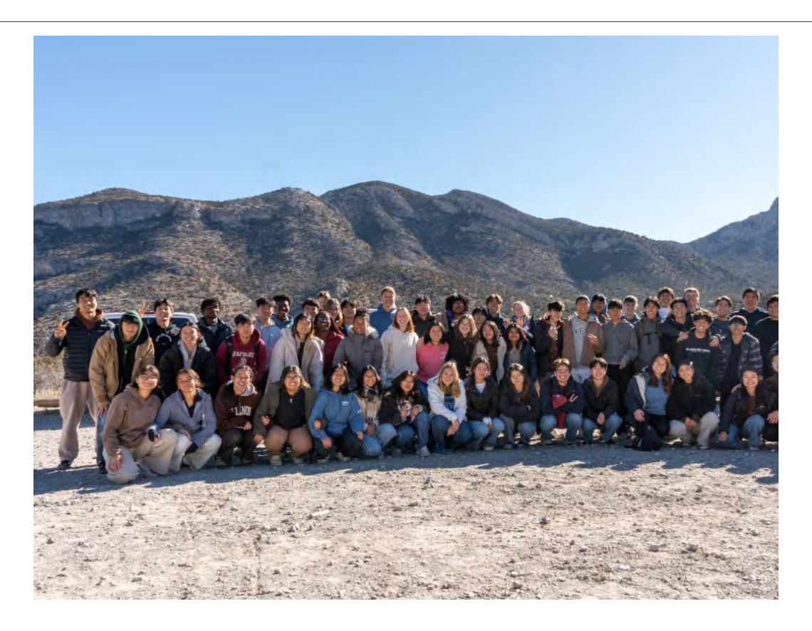
GPA is excited to work side-by-side with communities to support True Mother's hopes and vision.

If you or someone you know is interested in participating in next year's program, applications are currently open! Early bird rate is $0, apply before it goes up.