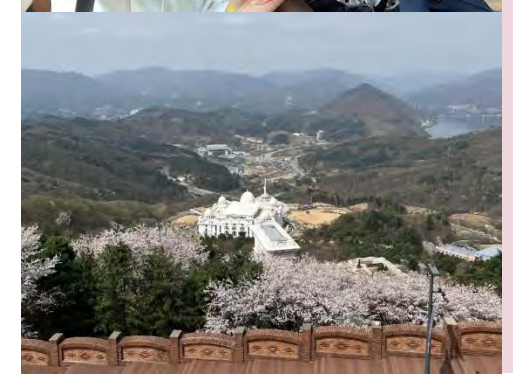
Last Day in Korea