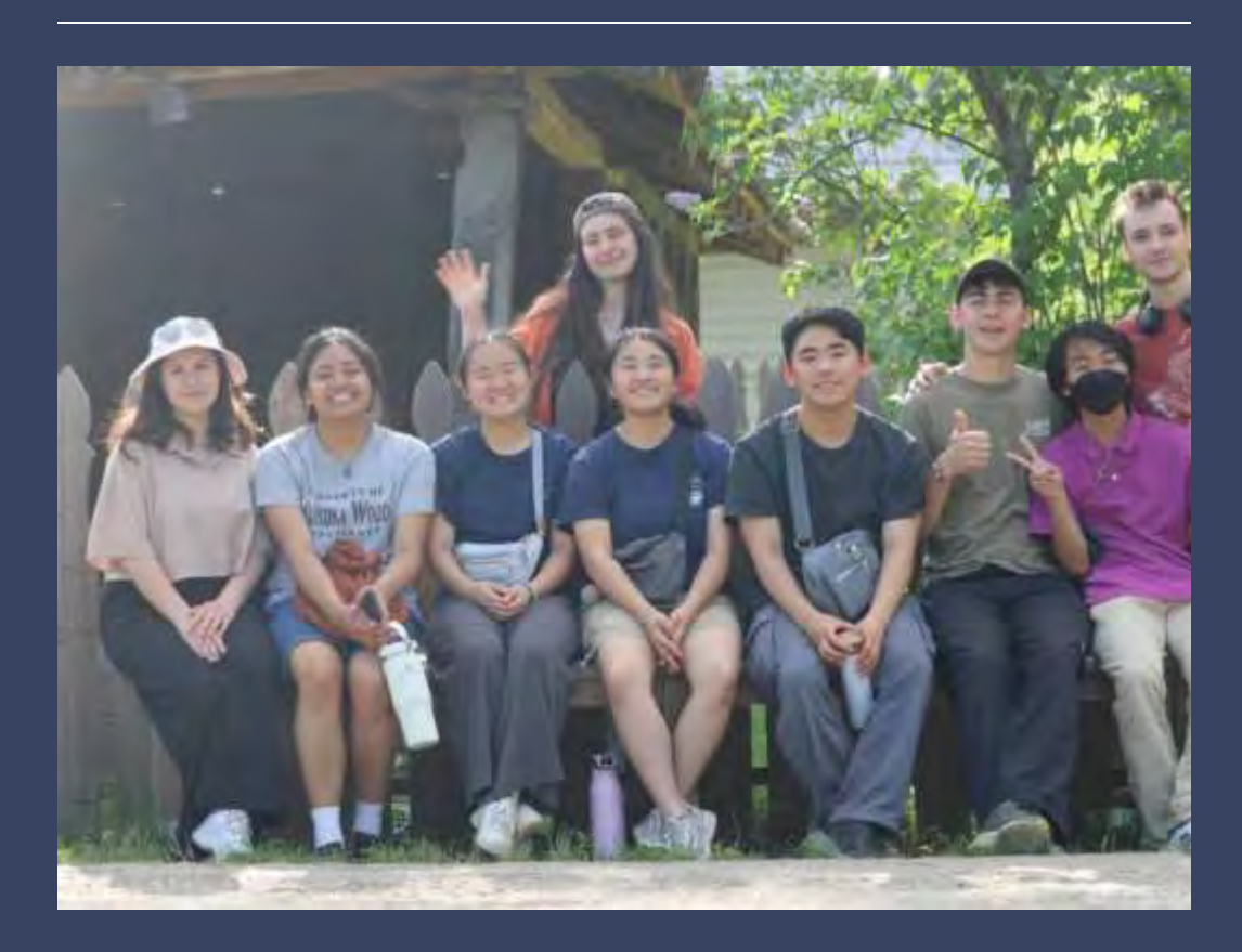
Pictured above: This year's Cheon Il Guk Romania team!