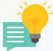
Receive a Matching Suggestion