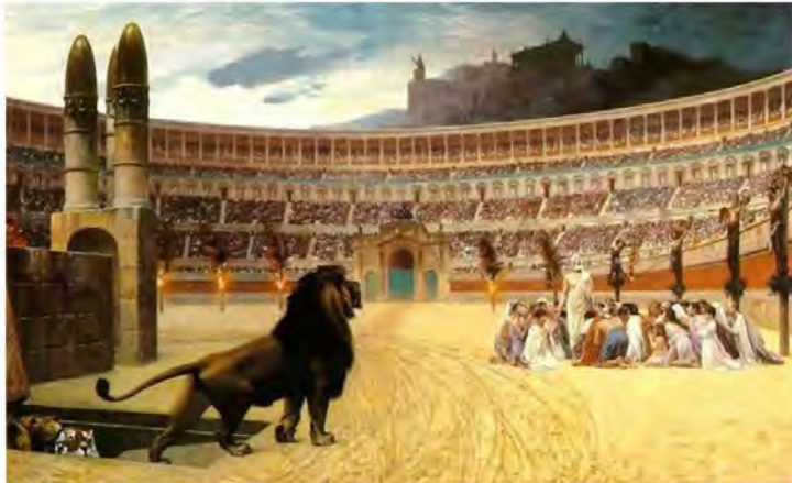
The Christian Martyrs' Last Prayer, painting by Jean-Leon Gerome (1824-1904). Public domain image.

Dear members around the world, True Mother , who spent the weekend in longing and love for all her children, continues, as she has for over 80 years, to endure and wait patiently, like a pure lotus blooming from muddy water, hoping that we fulfill our responsibilities.