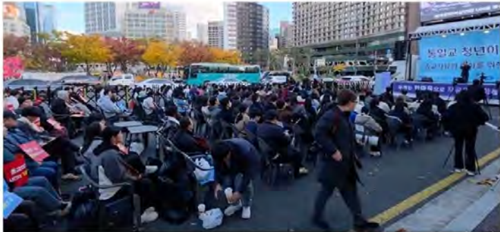
From a large demonstration rally in support of Mother Han near Seoul City Hall 2nd November 2025 organized by Incheon, Gyeonggi Northern Diocese of the Family Federation for World Peace and Unification. The rally had the theme “One Heart, One Peace Rally for Religious Freedom and Peace”. It was attended by about 2,000 persons.

Hello to all our members around the world who are once again offering your sincere devotion today. The weather has suddenly turned quite chilly. Despite the cold, many of our “brothers and sisters” are still offering devotion in front of the detention center. Shall we all give them a big round of applause filled with encouragement and gratitude? [...]