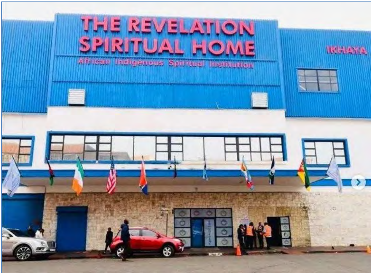
One of the South African centers of the Revelation Spiritual Home (TRSH)

"Great things will come": In powerful message of support for Mother Han, South African spiritual leader urges everyone to stand up, pray, fight, and be on fire!