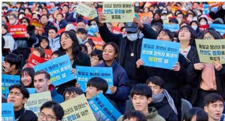
From a large demonstration rally in support of Mother Han near Seoul City Hall 2nd November 2025 organized by Incheon, Gyeonggi Northern Diocese of the Family Federation for World Peace and Unification . The rally had the theme “One Heart, One Peace Rally for Religious Freedom and Peace”. It was attended by about 2,000 persons.