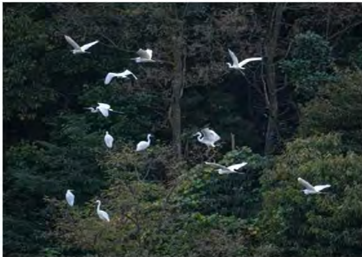
Egrets in Gapyeong, South Korea on 26th October 2025.

If we on earth fulfill our responsibilities and roles, the spiritual world – the initiating world of Heaven – will surely support us. Let us go forward with absolute faith and sincerity, resembling True Mother , so that True Father [...] and all the absolute good spirits can work through our lives.