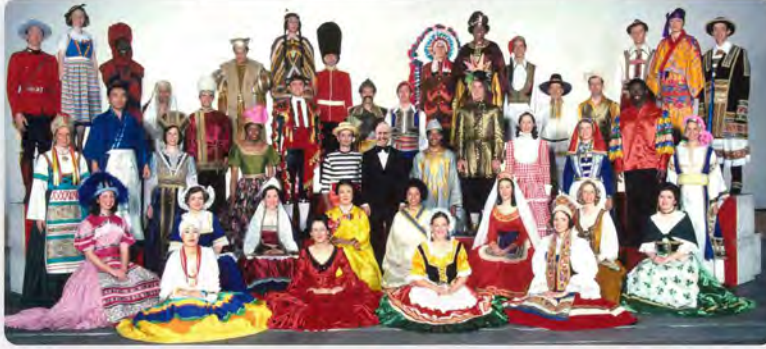
This photograph (from page 110) presents the extravagantly colorful international wardrobe the choir was glad to acquire early in 1976, once they had paid off all their debts and still had a little money in the bank.