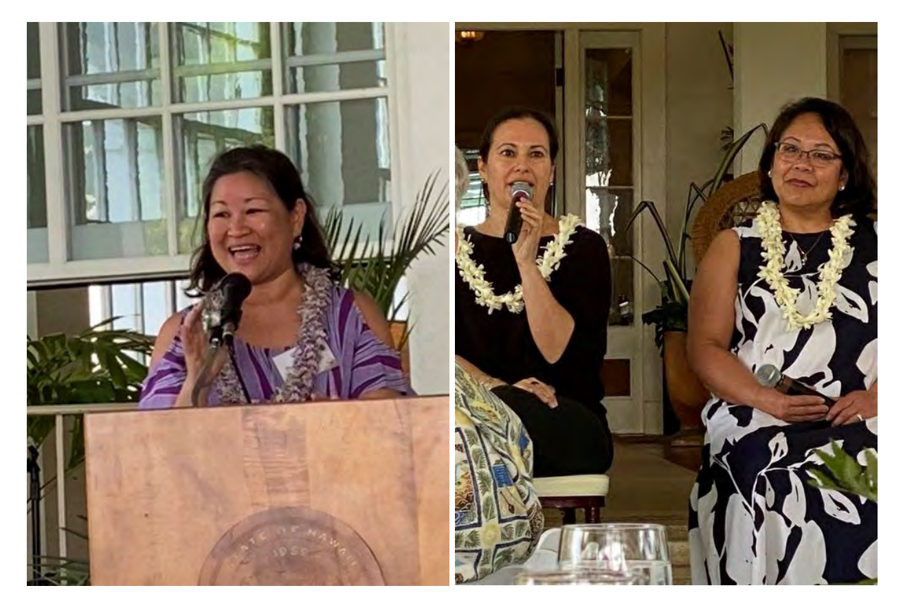
The atmosphere was warm and empowering, filled with genuine connections and shared purpose. Attendees exchanged ideas, contact information, and encouragement as they envisioned the future of women's leadership. Many emphasized the importance of nurturing young women through mentorship

Panelists shared candid reflections on overcoming adversity, managing stress, and the value of mentorship. Stories ranged from creating peaceful morning rituals - like gardening before the world awakens - to lessons in self-worth, intentional living, and being present amid the demands of professional and personal life. One speaker noted, "You can't have it all, but you can prioritize what truly matters."