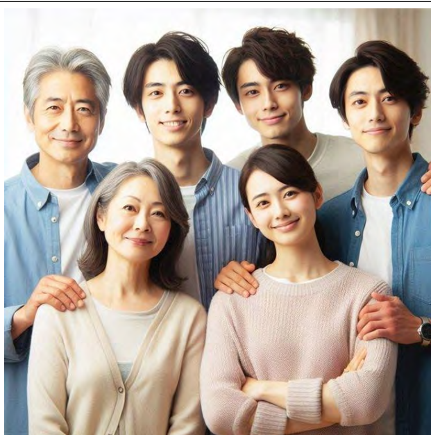
The family is at the core of the teachings of the Family Federation

These members often prioritized the goal of world peace over their own families and set out on global missions with a strong sense of purpose. Among many members who shared this mindset, there was a tendency to lose balance, which led to irregularities (歪) within their families.