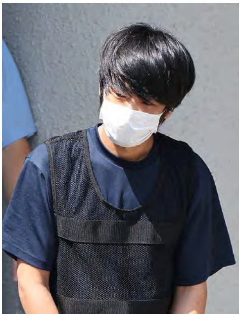
Committed heinous crime: Tetsuya Yamagami, the man who killed Shinzo Abe, the former prime minister of Japan

Sekai Nippo: It has been reported that Tetsuya Yamagami (山上徹也), the suspect in the shooting of former Prime Minister Shinzo Abe (安倍晋三), stated that his motive for the crime was linked to the substantial donations his mother made to the Family Federation for World Peace and Unification (formerly the Unification Church ) after becoming a member. How do you respond to the suggestion that the circumstances of members' families contributed to this tragic incident?