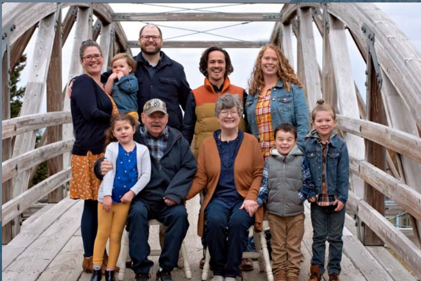
Family Photoshoot, Fall 2019