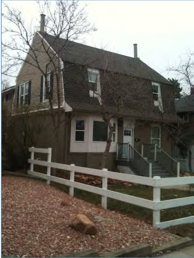
The Unified Family Boulder Center, 1121 Eleventh Street, Boulder, CO 80302. Paul Valin stated that Edgar (Sandy) Boshart rented it on November 20, 1972. We lived there until June, 1973. Photo taken in 2014 showing the updated building.