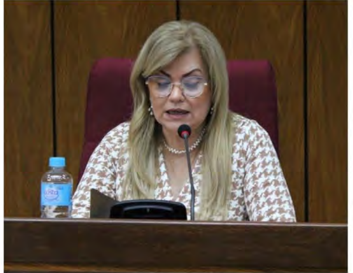
Emilia Franco, former First Lady Paraguay