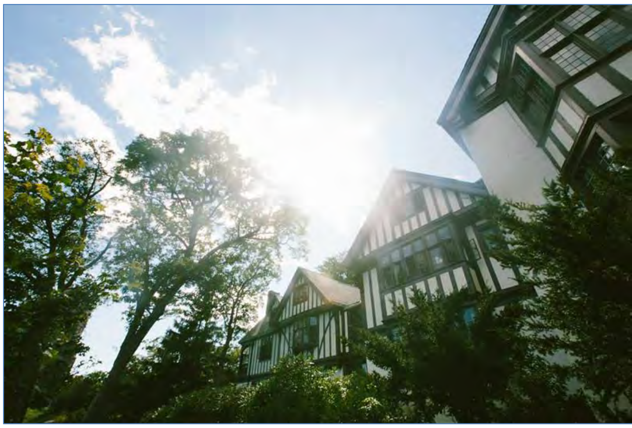
Morning Garden property in Gloucester, MA

A young Unificationist recently launched a fundraising campaign that <u>raised</u> more than $4,700 for much needed repairs at Morning Garden. The historic property in the coastal city of Gloucester, Mass., is where the late Rev. Dr. Sun Myung Moon and Dr. Hak Ja Han Moon, co-founders of Family Federation for World Peace and Unification (FFWPU), began Ocean Church.