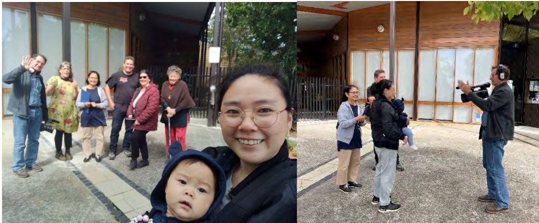
New Street Witnessing:

Womens Federation Victoria held a successful and well attended Faith Stories event on the first Saturday of the month. Women from Bhuddist, Catholic, Jewsih and Taoist background gave their testimonies of the jounry of faith.