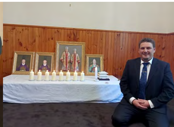
Settlement of Cheonshimwon prayer hall: