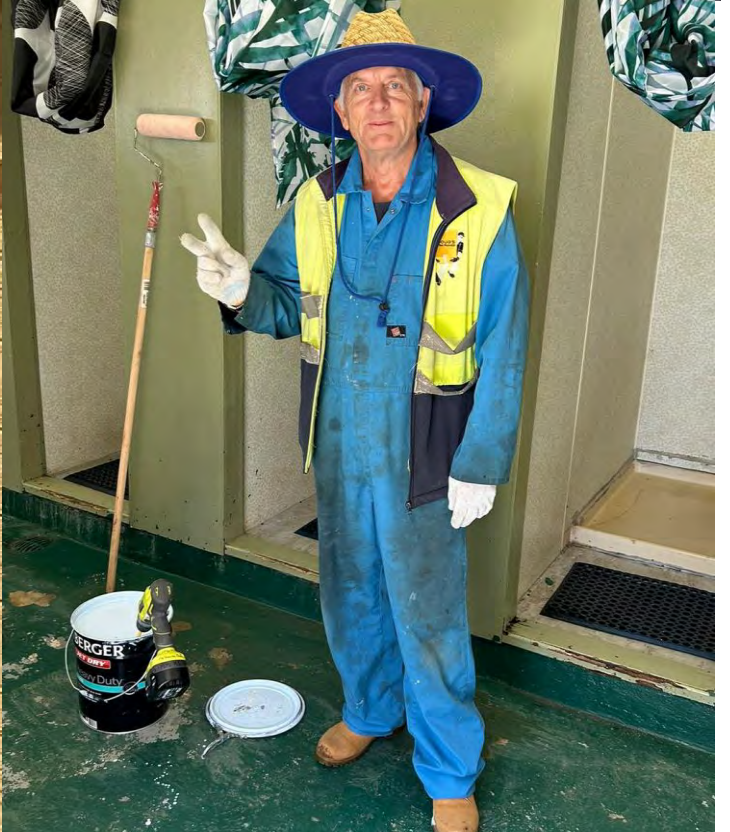
A big clean up was held on Saturday in preparation for the upcoming Cheon Bo. Toilet floors were repainted, the oval was levelled, weeding and various other clean up projects were worked on. Several picnic tables were also constructed.