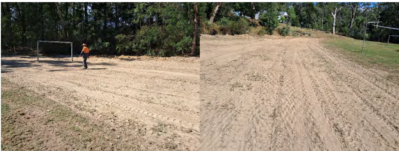
James Babb hired a machine that levelled the Oval. For about a year it had been unusable due to the work done on it for the sewerage. Now it is flat again we can work on regrowing the grass.