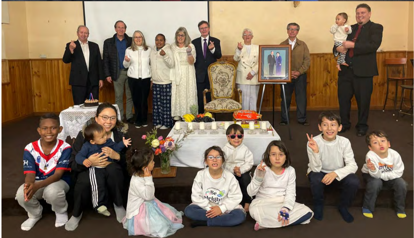
Members gathered for the 63 rd Day of All True Things. Offering tables were offered in the Belgrave Church as well as in Geelong by the Apps family, who have a strong tradition of Holy Day observance. We were happy to invite our visiting Solomon Island family to join us.