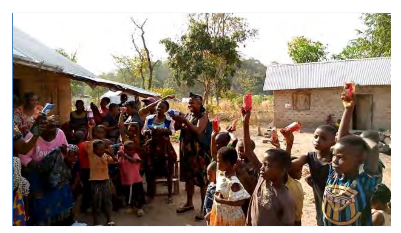
The PECEFUL FAMILIES ORGANIZATION and the AMBAZONIAN SPIRITUAL RELIEF

Even while in the deserts of despair without oasis of love the Southern Cameroonian refugees in the Adagaom Refugee Settlement 1 and 3 could still receive drops of merriness and a dew of solidarity in the midst of this 2020 Christmas.