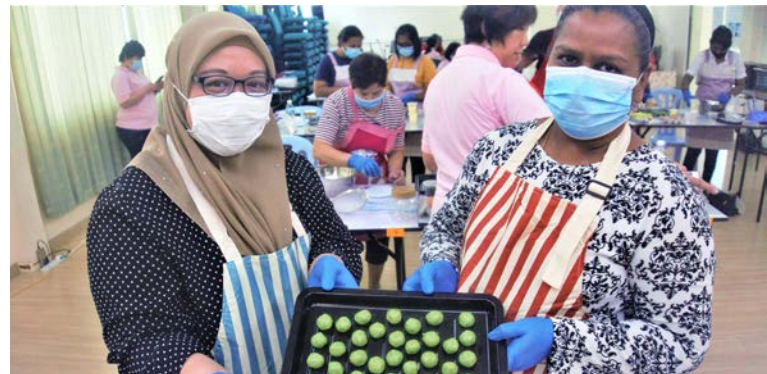
Underprivileged women were given a chance to learn new skills to stand on their own feet.

The workshop is very timely especially in the difficult time of the Covid-19 pandemic, where many are barely surviving to make a living.