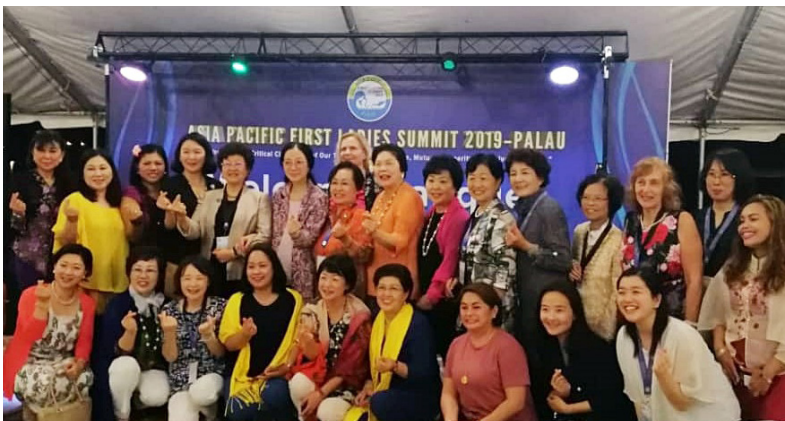
Group photo with representatives of WFWP chapters in Asia Pacific.