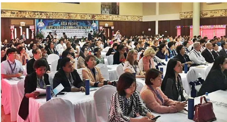
500 delegates from 38 nations participated in the summit.