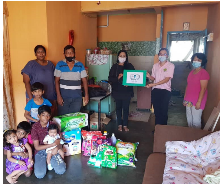
Donation of necessities and food items to a less fortunate family in Bandar Kundang, Rawang.

On 30 October 2020, WFP Malaysia extended humanitarian assistance to the Persatuan Kebajikan Siva Sakthi Samaj in Setapak, Kuala Lumpur. The center currently provides permanent shelter for 15 school-going children and also serves free vegetarian lunch to 25 low-income families in the nearby area on a daily basis. We thank all donors for the contribution of items for the people in need.