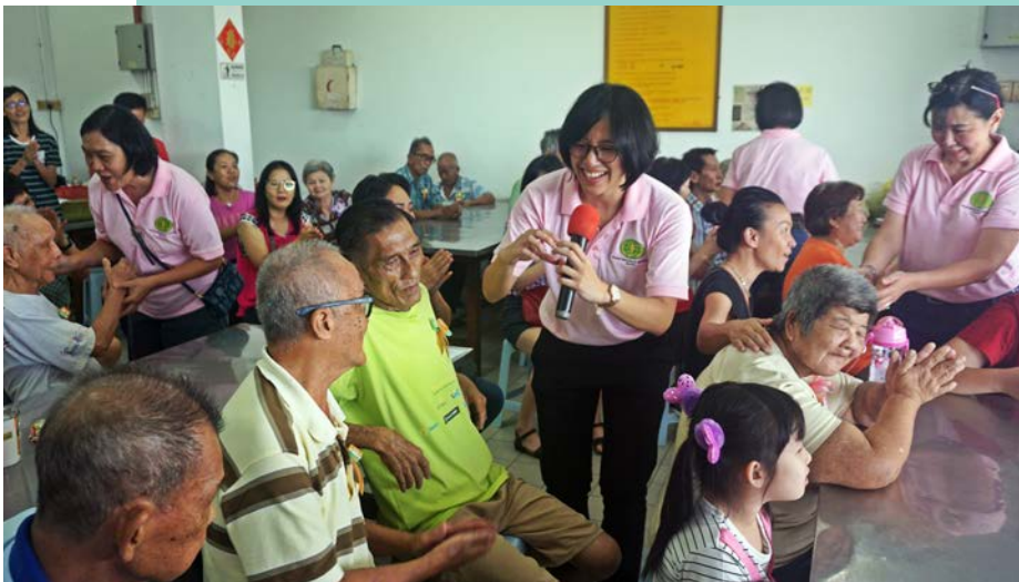
► Volunteers brought joy and warmth to the seniors through interactive sessions.