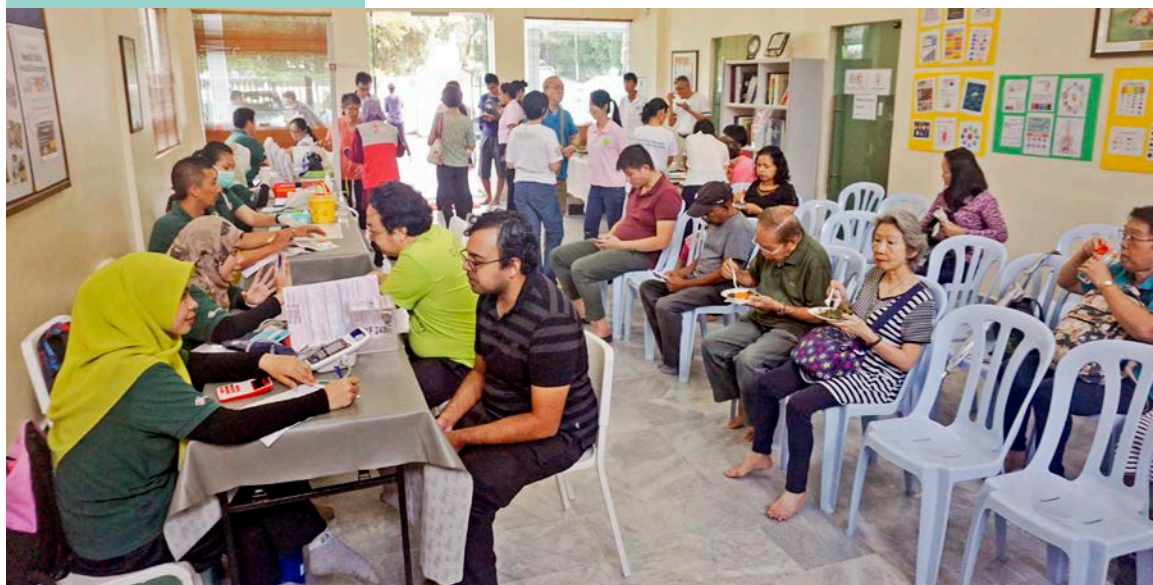
Members of the public queuing up for health screening at the Peace Embassy.