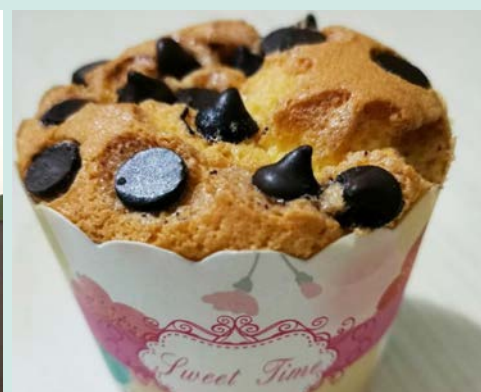
Orange chocolate chip cupcake