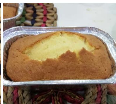
Green pea cookies, chocolate cookies and butter cake