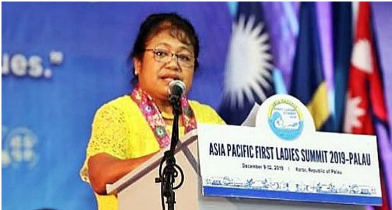
First Lady of Republic of Palau, H.E. Debbie M. Remengesau delivered the keynote speech in the Opening Plenary of the Asia Pacific First Ladies Summit 2019 held in Koror, Palau.