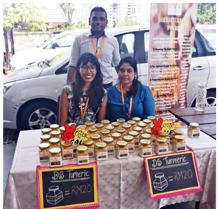
Charity sales of organic turmeric powder by Dharma Shakti Ashram