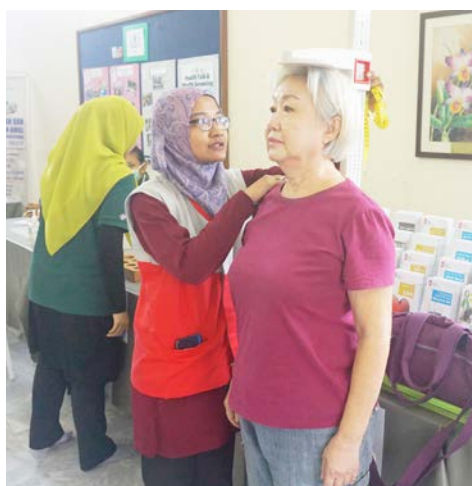
Free health screening for the public.