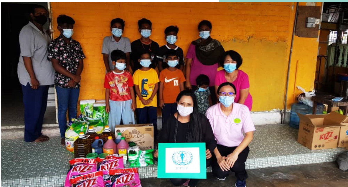
Contribution of groceries to Persatuan Kebajikan Siva Sakthi Samaj in Setapak.