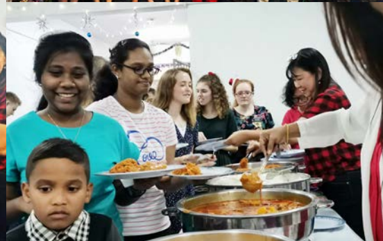
The children celebrated a warm Christmas with carolling, delicious food and gifts.