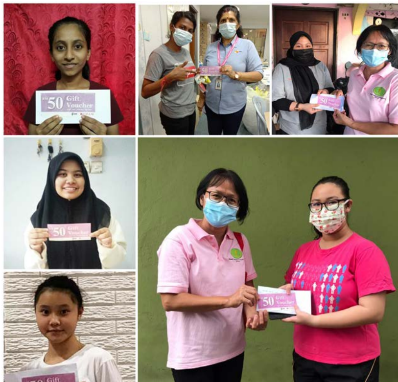
Less fortunate students received book vouchers under the Adolescent Girls Empowerment Programme