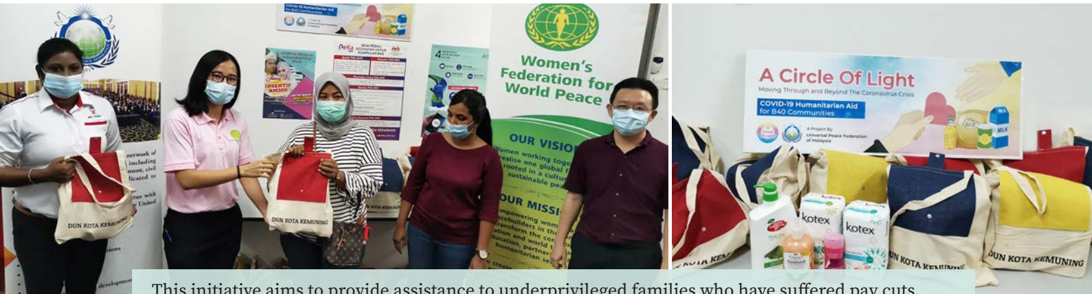
This initiative aims to provide assistance to underprivileged families who have suffered pay cuts, loss of a career, or other consequences brought about by the outbreak.