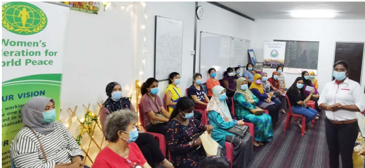
30 underprivileged women benefited from this humanitarian aid.