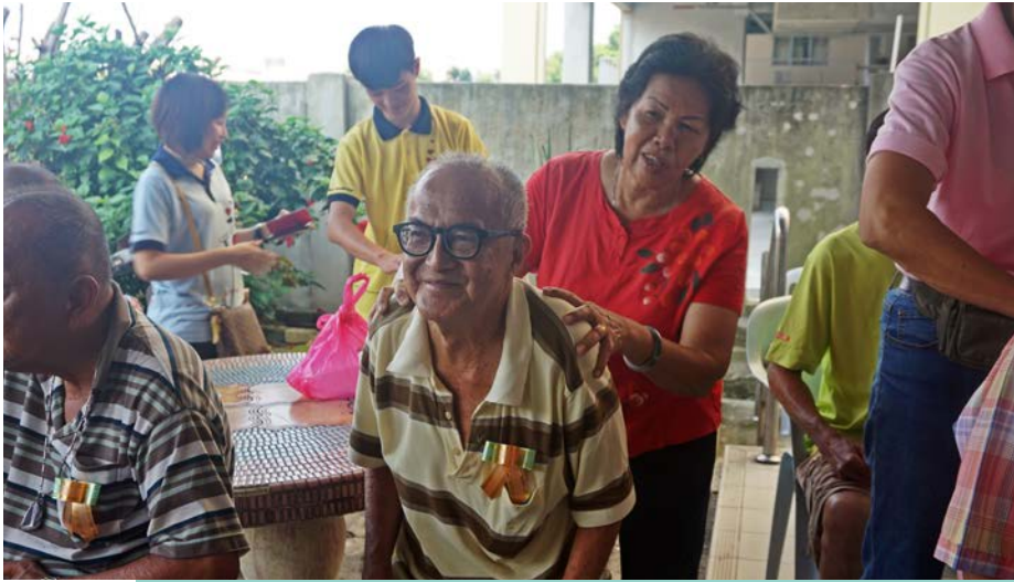
► The seniors enjoyed a gentle massage from our friendly volunteers.