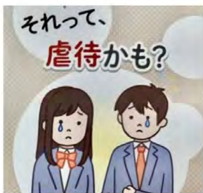
From the cover of a pamphlet used in Japanese schools.

The upbringing based on Endo's mother's Catholic faith could be considered a form of abuse by some according to the guidelines hastily prepared by the Ministry of Health, Labour and Welfare after the assassination of former Prime Minister Shinzo Abe (安倍晋三), titled "Q&A on Responding to Child Abuse Related to Religious Beliefs". Those guidelines have been criticized domestically and internationally for potentially leading to religious