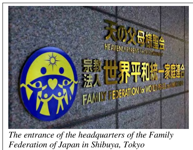
The entrance of the headquarters of the Family Federation of Japan in Shibuya, Tokyo

"I deeply feel how much my parents struggled to make donations. However, I also feel that the Family Federation today is a reformed organization that reflects on and has corrected its past excesses. I hope the media will report on it fairly."