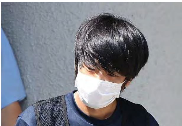
Tetsuya Yamagami, the man who killed Shinzo Abe, the former prime minister of Japan

"When I was in vocational school, my parents couldn't pay my dorm fees because of the donations they were making, so I had to cover them with my part-time job earnings. I don't hold any grudge against my parents now, but at the time, I was unhappy. I think there are people who have let that sense of resentment toward their parents grow and intensify.