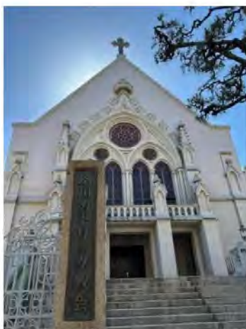
The Catholic Shukugawa Church in Nishinomiya, Hyogo Prefecture, where Shusaku Endo was baptized.

At one point, Endo resolved to stop trying to discard this "ill-fitting garment", deciding instead to "tailor it into a kimono that would fit me". This decision led him to explore the theme of Christianity through a Japanese lens, which resulted in his distinctive portrayal of a maternal, companion-like Jesus, contrasting with the paternal image often associated with Christianity.