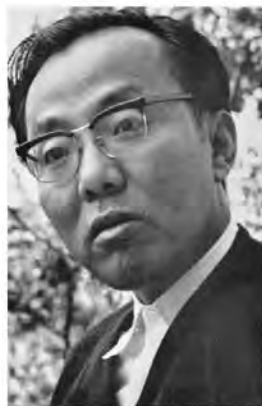
Shusaku Endo, photographed on 21st October 1966 at his home in Tamagawa Gakuen, Machida City, Japan.

"To be precise, rather than saying I 'received' baptism, it would be more accurate to say it was 'given' to me. It was not an act born from an irrepressible personal conviction" ("The Ill-Fitting Garment").