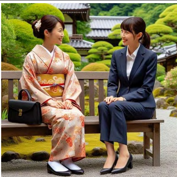
Japanese ladies talking about their faith