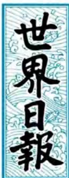
Logo of the Sekai Nippo

Japan copying communist China: state prying into family matters and faith passed naturally from parents to children