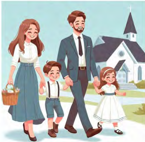
Happy family going to church. Illustration: Microsoft Designer Image Creator, 2nd November 2024.

See part 5: The Distorted Image of the "Second-Generation" : 29th article , 30th article , 31st article , 32nd article , 33rd article , 34th article