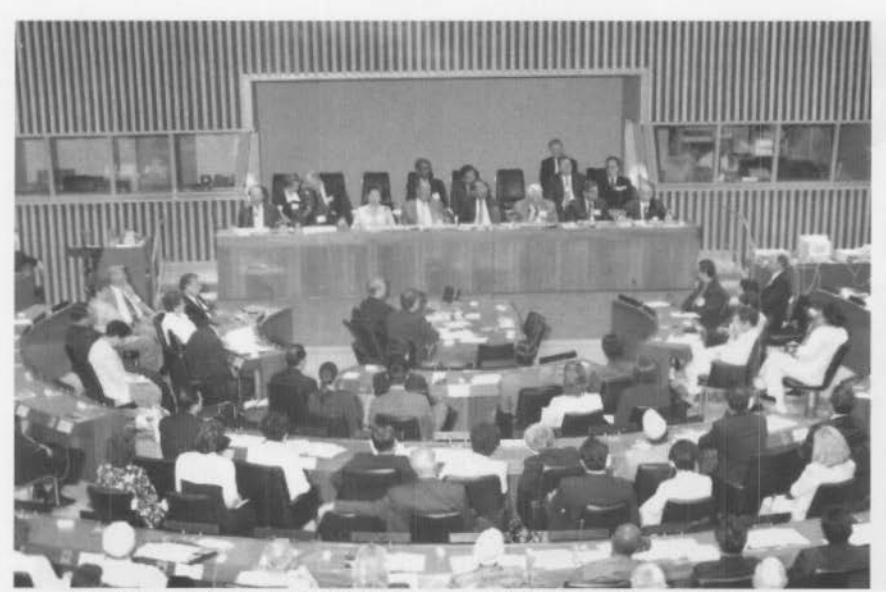
Rev. Moon calls on the United Nations in 2001 to consider establishing an interreligious council and to develop 'peace zones' to reduce global conflict.