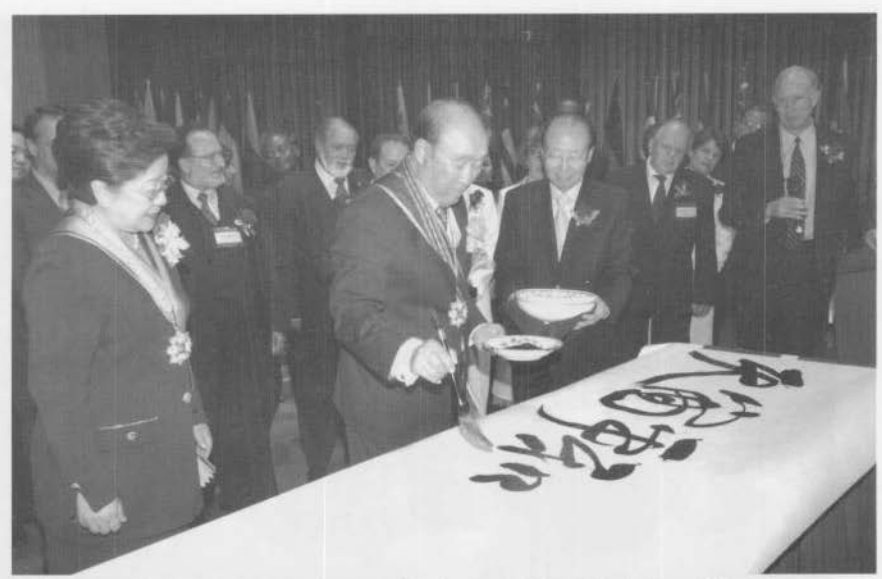
On September 12, 2005, at the Lincoln Center in New York, Rev. Moon announced the inauguration of the Universal Peace Federation with the mission to bring together all nations and religions to 'live for the sake of others.'