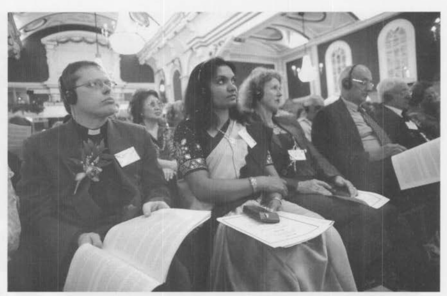
Those who hear the UPF message have commented that it helped them focus on the need for new ways to overcome the barriers and prejudices confronted in daily life.