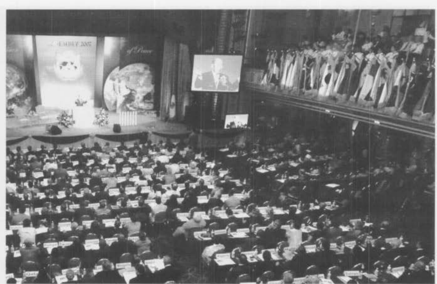
At the Manhattan Center on September 23, 2007, delegates from 194 nations promised to lay the foundations for a new 'Abel' or 'Peace' UN worldwide