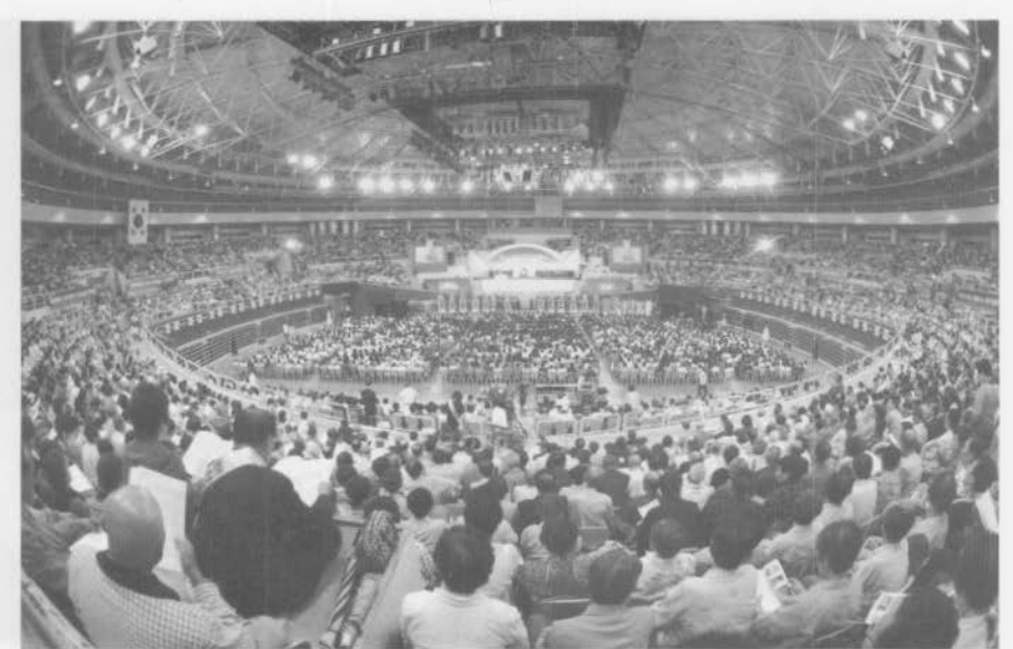
Rev. Moon speaking in Busan during the 2005 Peace Tour on the subject of "God's Ideal Family and the Kingdom of the Peaceful Ideal World," calling for intercultural marriage and interreligious dialogue as the best way forward to reach a world of peace.