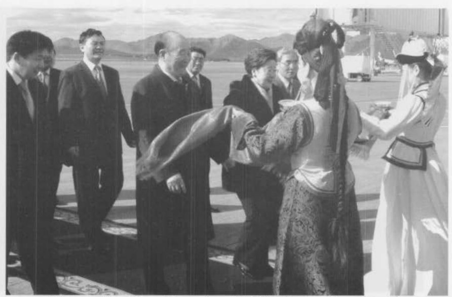
Rev. and Mrs. Moon being welcomed to Ulaanbaatar, Mongolia, with a traditional drink of mare's milk during their 100 city peace tour in 2005.