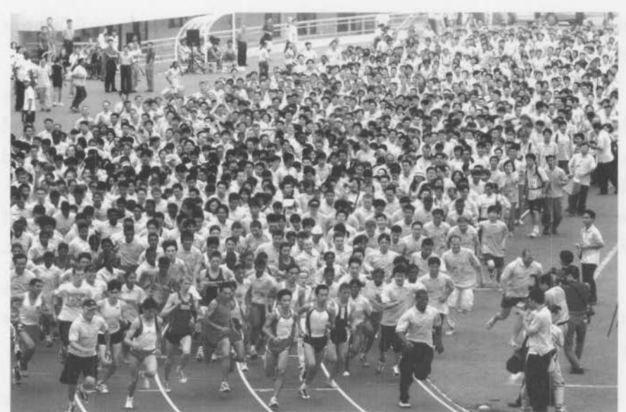
The Interreligious Peace Sports Festival brings young athletes from around the world to develop athletic abilities and build new friendships beyond race, religion and culture.