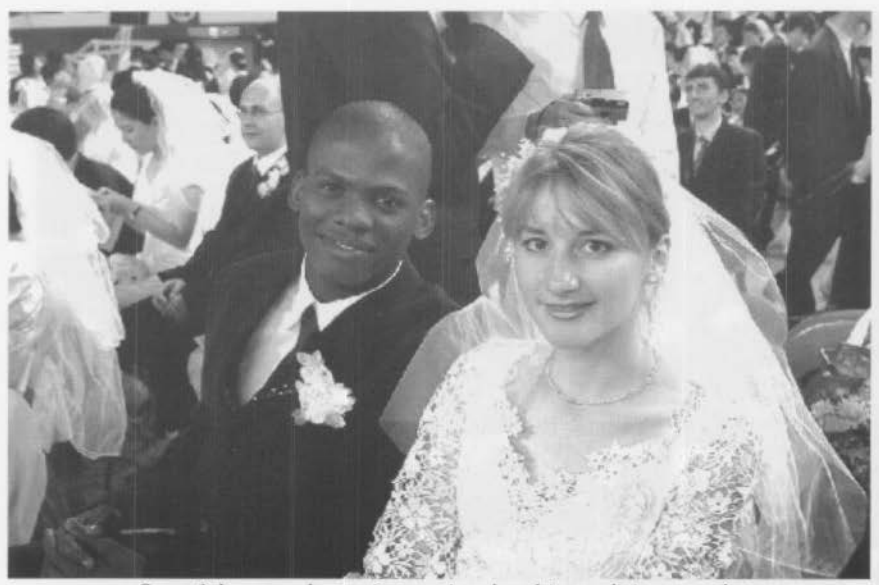
One of the many happy international and interreligious couples Blessed by Rev. and Mrs. Moon