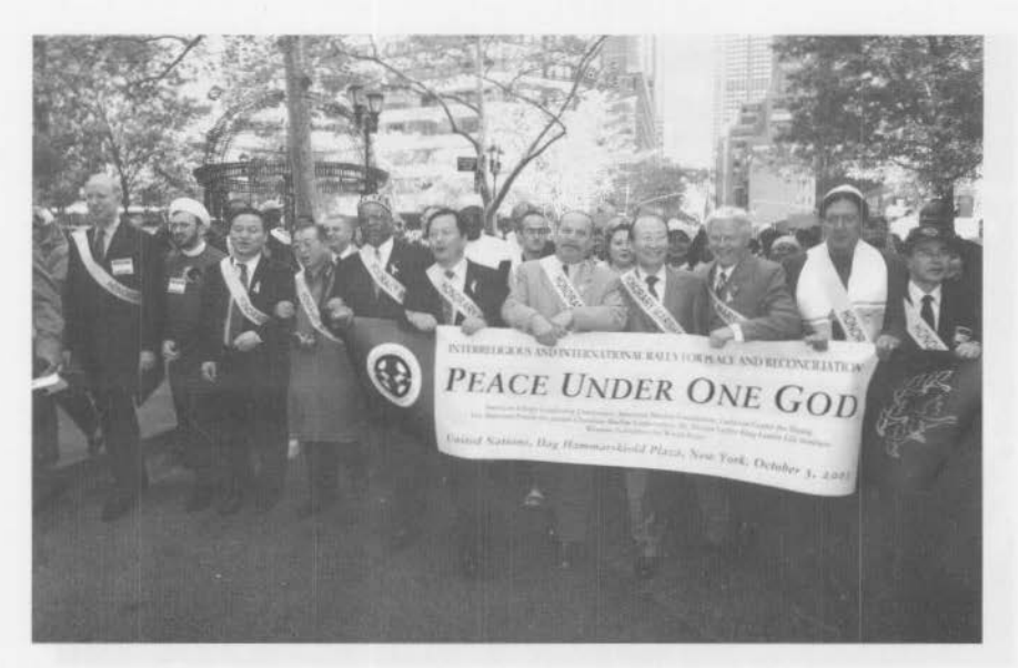
At the Dag Hammarskjold Plaza near the United Nations headquarters in 2003, religious leaders from many faiths joined a march and rally for "Peace Under One God."