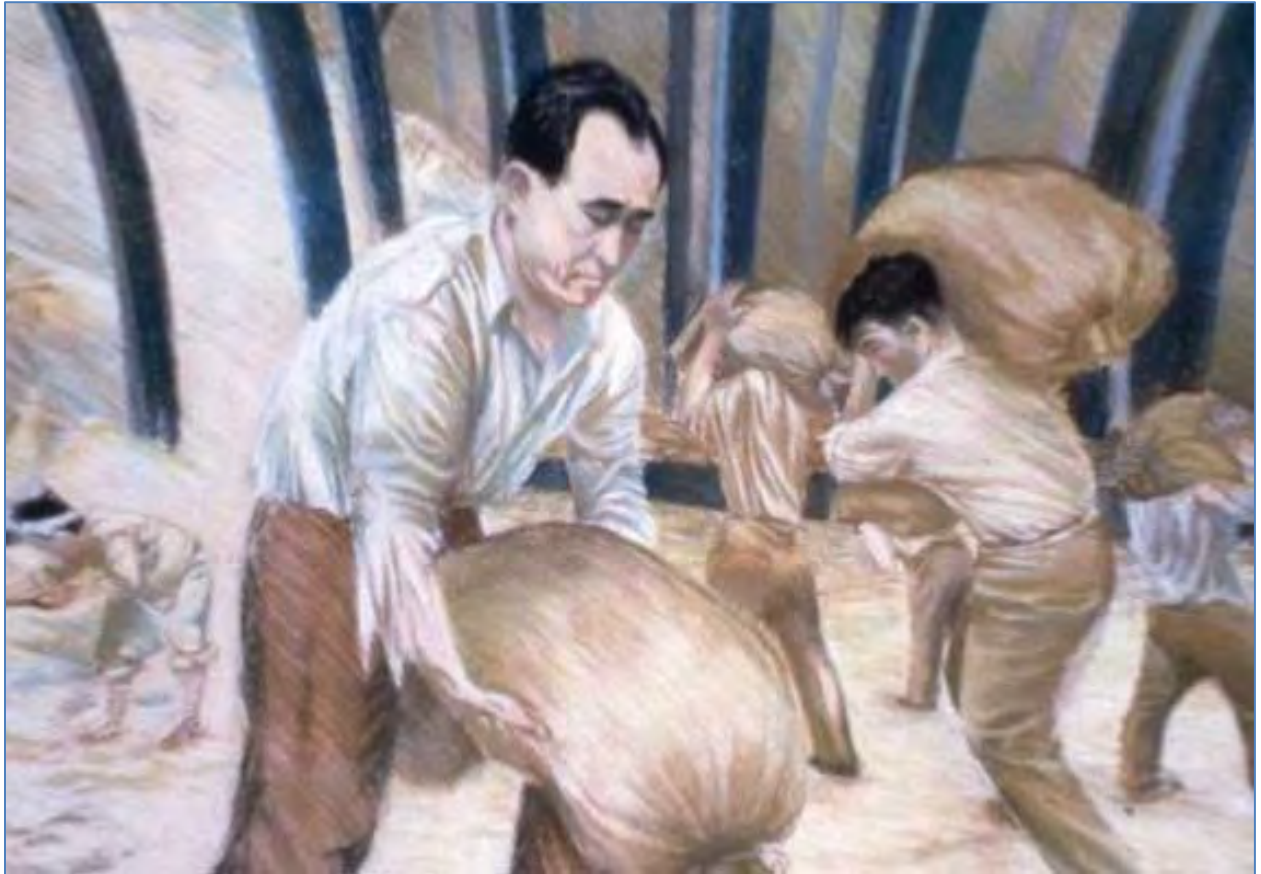
A painting of True Father in Hungnam Labor Camp