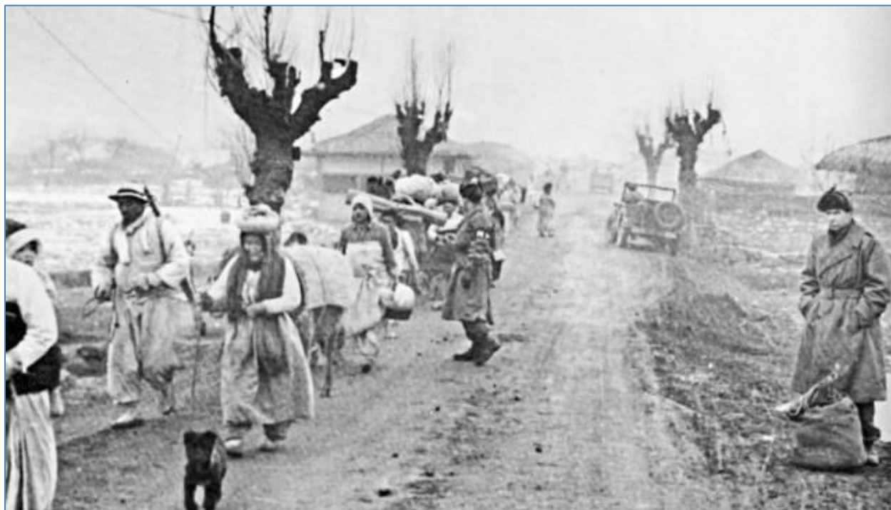
Refugees moving toward south

Republished by International HQ Mission Office January 14, 2022