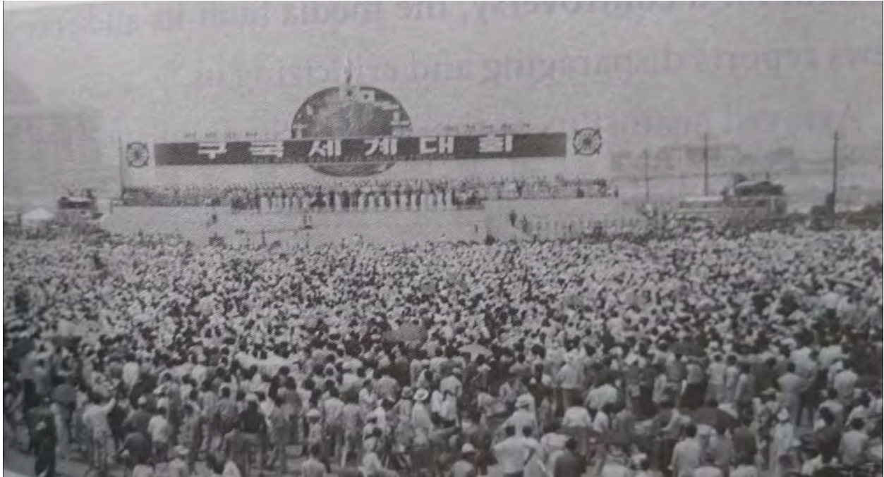
June 7, 1975: the World Rally for Korean Freedom, Yoido Plaza

Square Garden, with a speech entitled, "The New Future of Christianity." It was the first really large venue the Unification Church had sought to fill, and the event had an amazing impact. More than 30,000 people packed the Garden, while another 30,000 had to be turned away.