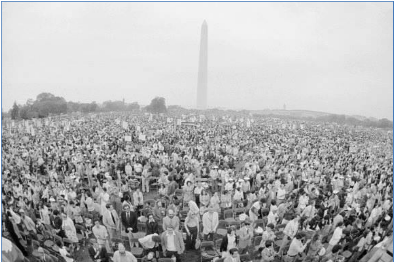
September 18, 1976: The God-Bless America Festival at Washington Monument, Washington DC

on the way to the gallows, not out of fear for ourselves, but because of the enormous providential significance riding on the outcome.