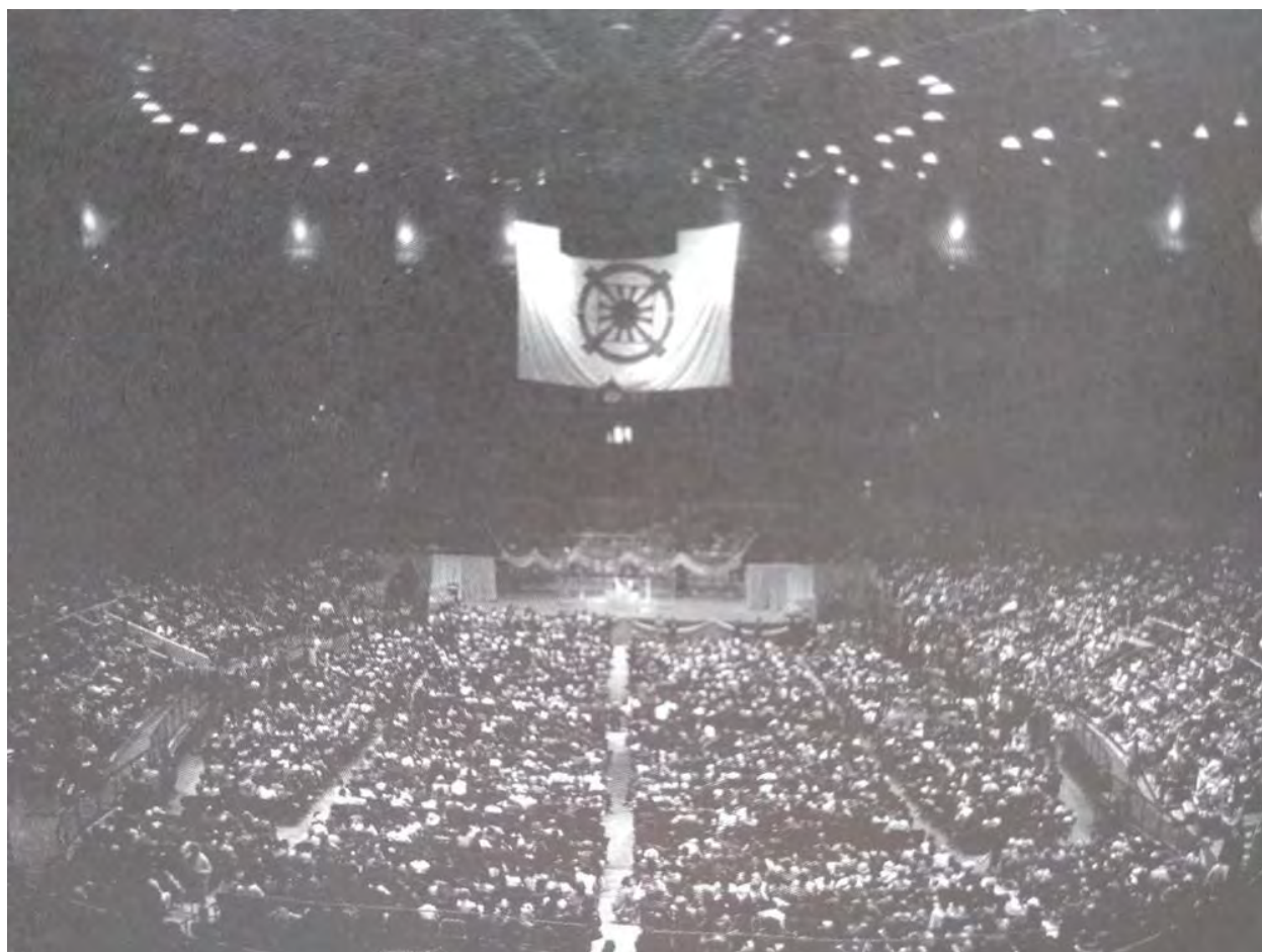
September 18, 1974: The New Future of Christianity rally, Madison Square Garden, New York

Early in 1974, President Nixon sent us an invitation to meet him in the White House. Mr. Nixon was anxious, aware of the likelihood of impeachment. As members covered the White House in prayer, my husband counseled him to: stand strong, confess any wrongdoing, and call for national prayer, unity and renewal.