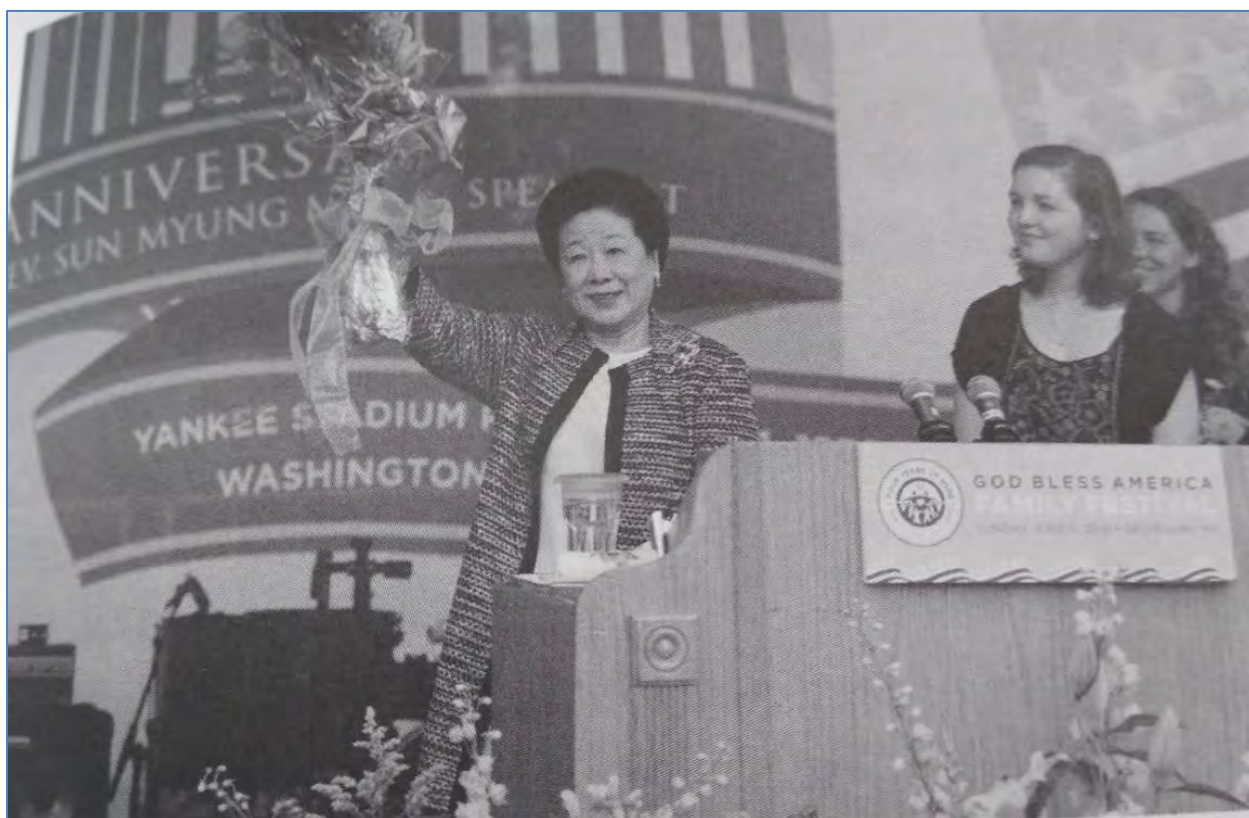
2016: The 40th Anniversary of the Yankee Stadium Rally, Belvedere, New York

and door to door, create home churches, fish businesses and restaurants, and organize volunteer service projects. On every path we trod, the blood, sweat and tears of our frontline missionaries, domestic and international, continued to flow. I was constantly in prayer.