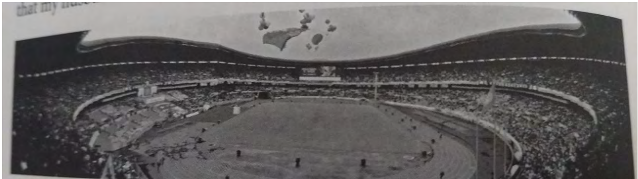
April 10, 1992: 150,000 attend the inaugural rally of Women's Federation for World Peace in Seoul

My husband and I founded the Women's Federation for World Peace. After its inauguration rally at the Olympic Stadium in Seoul in April 1992, about which I will also speak below, I held a series of events to launch Women's Federation chapters in 40 Korean cities. I spoke on the theme, "Women Will Play a Leading Role in the Ideal World." We wondered what would be the turnout for these events and were grateful that every venue was filled to capacity. Although the speech focused on women, many men attended as well. I saw the era of women that my husband and I were advancing taking shape before my eyes.