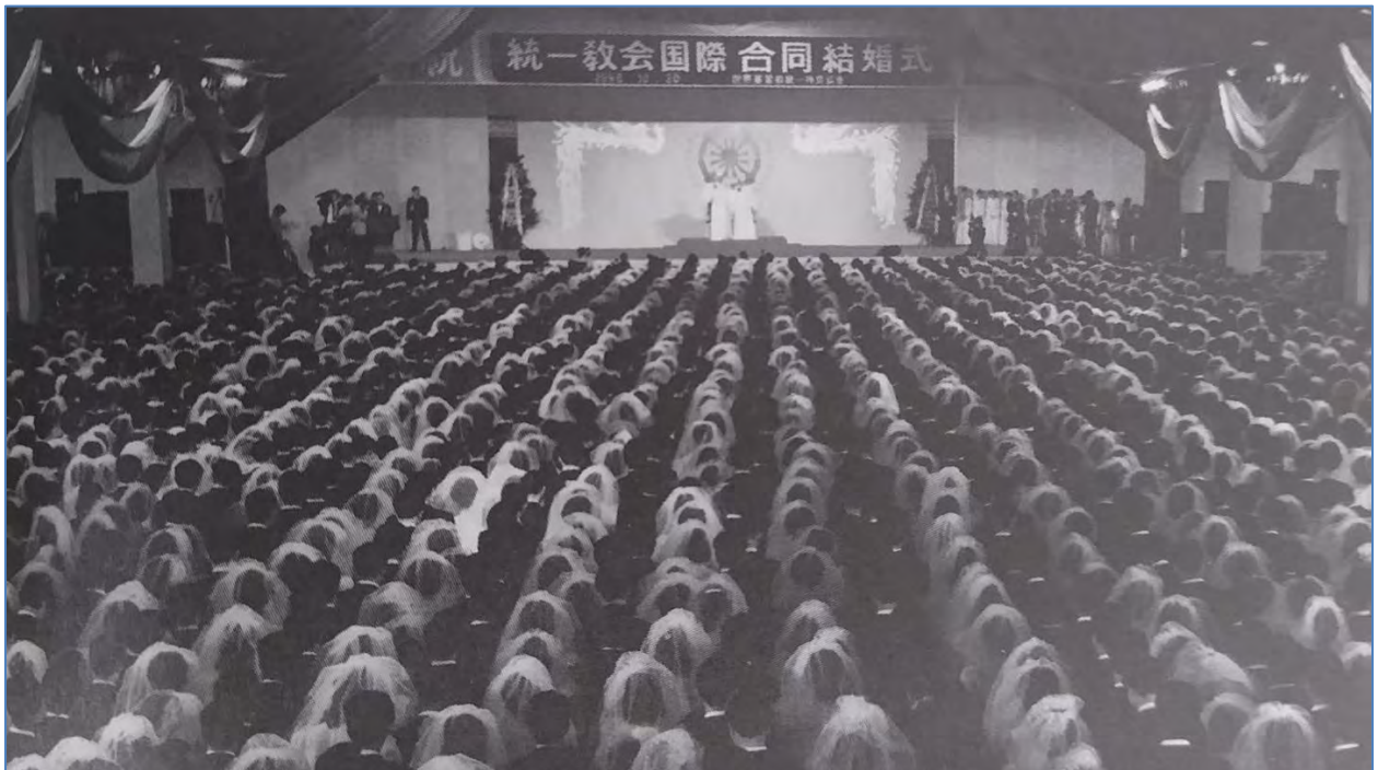
October 30, 1988: The 6,500-couple International Blessing Ceremony that brought thousands of multicultural families to Korea.

However, Japanese and other Unificationist women, understanding faith in God, the concept of filial devotion and the idea of "living for the sake of others," agreed to marry Korean men and devoted themselves to their families. Brides from countries such as the Philippines, Vietnam and Thailand similarly also came to Korea and established international blessed families.