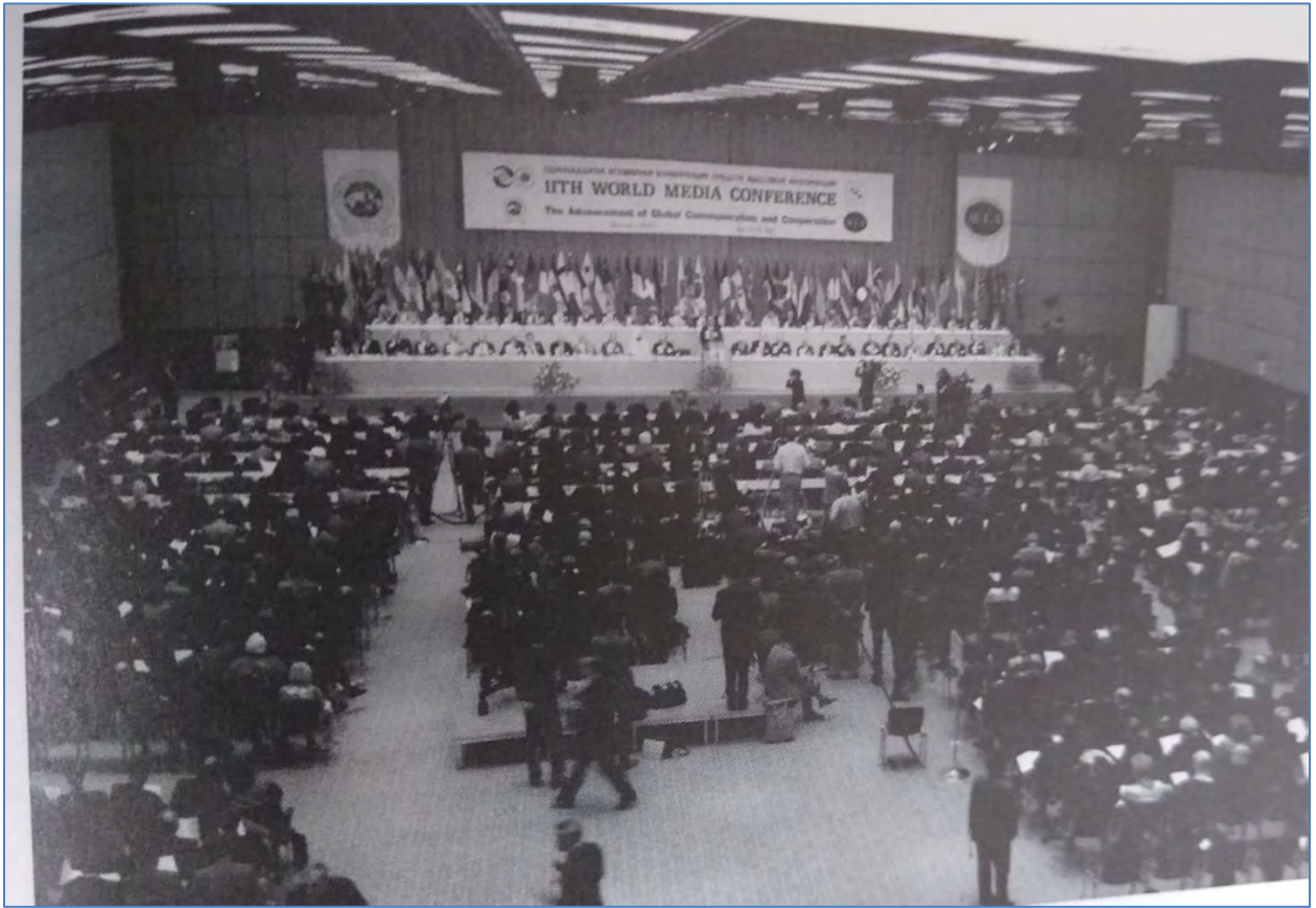
April 9, 1990: World Media Conference, Moscow

On November 27, 1994, at Belvedere Training Center in New York, Father Moon again announced my public mission as the movement's second founder. At that time, the educational program for 160,000 Japanese women and significant events in certain nations had concluded, so my role was expanding. On that day, I resolved in front of members, "Let's all pledge to become the family that will unite and establish the traditions of the True Parents."