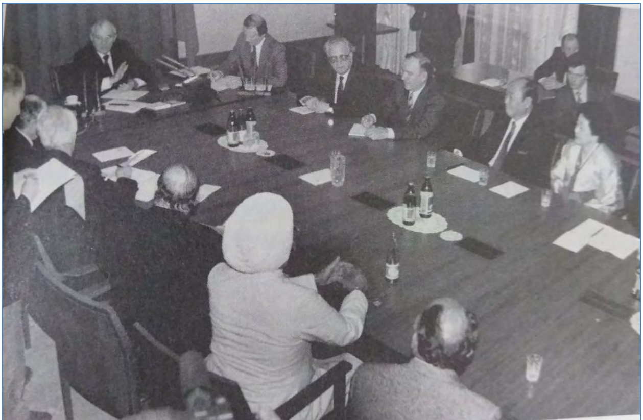
April 11, 1990 : Media conference participants meet with President Gorbachev at the Kremlin

As the meeting went on, my husband did not hesitate to advise President Gorbachev. "The success of the Soviet Union depends on whether you put God at the center or not," he said, and he was emphatic. "Atheism will lead to nothing but self-destruction and disaster." Father Moon told President Gorbachev that the only way for the Soviet Union was for Russia to continue his economic and political reforms and to allow freedom of religion. President Gorbachev's face showed he was well aware of the enormity of Father Moon's advice, yet he could not help but receive what we said. Never before had anyone said anything like that in the Kremlin. Looking back, I feel confident to say that the words we exchanged at that moment changed the history of the world. I truly felt that heaven and earth were listening to every word with bated breath.