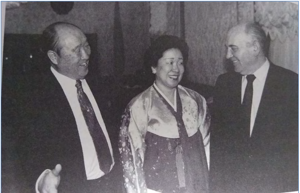
April 11, 1990 : Father and Mother Moon with President Mikhail Gorbachev