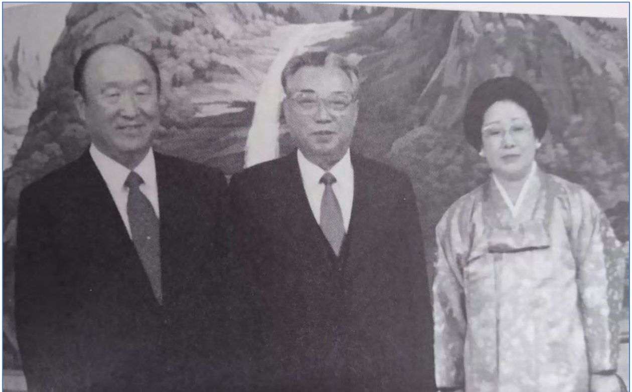
December 6, 1991: Meeting with North Korean leader Kim Il Sung. Father and Mother Moon were in North Korea for eight days.

I gazed at the sky in the direction of Anju, my hometown, 18 miles away. Is the old house that embraced me so snugly still standing there Is corn growing in the backyard field these days Where is my maternal Grandfather's grave I was curious about everything but I held it inside. We had come to meet with Chairman Kim Il Sung on behalf of our Heavenly Parent and shape the future of our homeland; We had come for the sake of the nation and the world. I could not entertain my personal feelings in light of that historic summons. I was there so that the day would come when all Koreans and all peoples will be free to visit their hometowns.