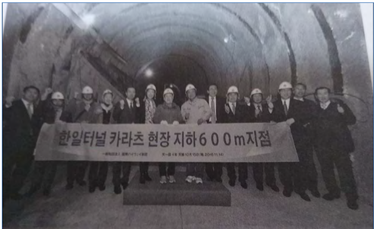
November 14, 2016: At the construction site of a test tunnel for the Korea-Japan Underwater Tunnel, Karatsu, Kyushu, Japan

That highway would pass through a tunnel connecting Korea's Busan with Karatsu, and there, in 1986, we commenced a pilot tunnel construction. I had long been interested in visiting the site. Finally, in 2016, I had the opportunity to go and see it. During my visit, I renewed our movement's commitment to the peace highway. I believe that the world's peoples are ready for this and that the time is ripe for launching the project based upon a global plan. To tell this story to the world, from the streets to the senate buildings, I had already created an affiliated project, "Peace Road." It consists of public, activism publicizing the international highway, and it has turned into a global movement for peace. I'll share more about Peace road later.