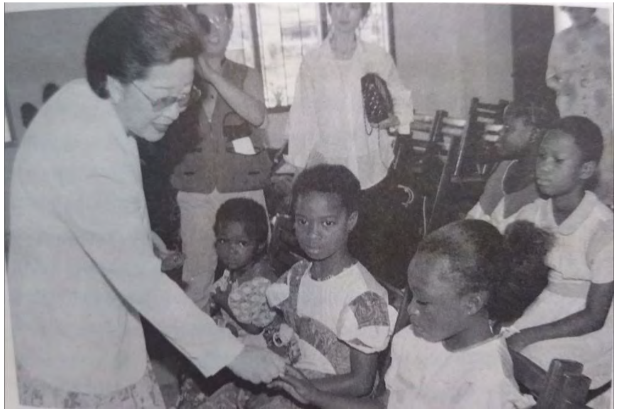
November 18, 1995, Visiting a social welfare center in Accra, Ghana

I sometimes visit orphanages and impoverished areas when I am in Africa or South America. Expanding on this impulse to help others, in the 1980s I founded the International Relief Friendship Foundation. As I have mentioned, I more recently set up the Women's Federation's 1% Love Share project and other non-profit service organizations. In addition, I established the Wonmo Pyeongae Scholarship Fund to award scholarships to promising college students with high ideals. When I see people in need, I cannot pass them by. That is the nature of true love that originates in the deepest heart of Heaven.