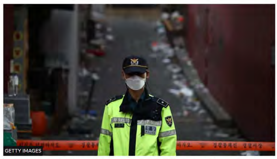
South Korea's police chief has said their emergency response was "inadequate"

The police officer told the first caller they would send someone "to go and check it out" - but no significant reinforcements were sent for hours.