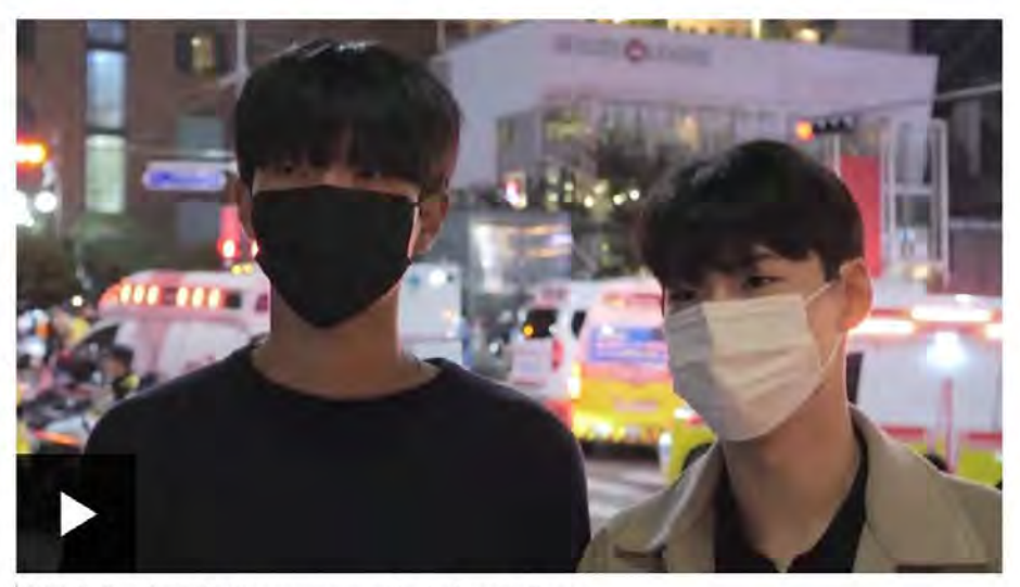
Watch: Seoul crush witnesses recount 'out of control' scene

"There were so many people that they needed normal people to do CPR. So everyone started jumping in to help," Ana told the BBC.