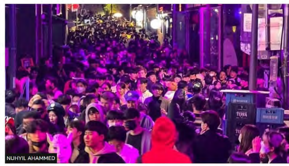
Large crowds gathered in Itaewon a few hours before the crush

Nuhyil Ahammed, 32, was in the crowd. The IT worker from India lives nearby and had been to Halloween parties in Itaewon before, but says things were very different this year.