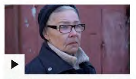
'The Russians are gone but I still live in cellar'