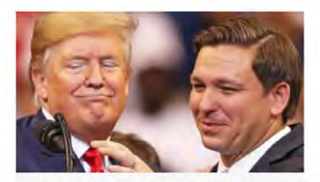
Weekly quiz: What was Trump's nickname for rival?

Why US election results are taking so long