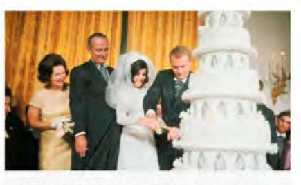
White House weddings - past and present