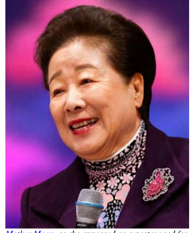
<u>Mother Moon</u>, as she appeared on a poster used for the Las Vegas gathering January 19, 19, 2025

Mother Moon's Las Vegas message: From 2025 we have entered a new era where we may directly attend God here on earth