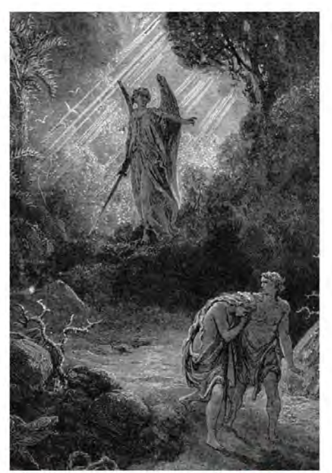
Adam and Eve expelled from Paradise. <u>Public</u> domain image. Cropped