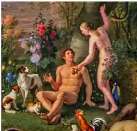
Adam and Eve in Paradise.

Because of the fall, we humans lost our originally intended position as true sons and daughters of God , who would have given them the stewardship of earth and heaven. Instead, the first humans fell to an incredibly low level when they were led astray by the archangel Lucifer and came under his dominion. Angels were created to be servants of God and human beings. We humans were created to be children of God . Instead, the first man and woman followed a rebellious angel and thus became the servants of a servant.