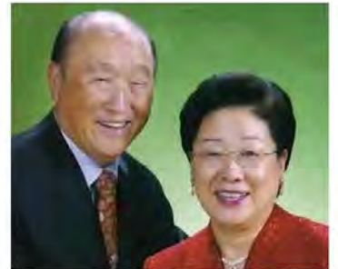
Father and Mother Moon

The significance of this special term is that God has finally been able to have a son and a daughter who have become the True Parents of humankind. Jesus only became the spiritual father of those who believe in him, because he never could hold the "Marriage of the Lamb". In other words, God had to wait for thousands of years before this ideal that True Parents represent could be realized. True Parents represent the very source of true love , true life, and a true lineage. It is only through True Parents that humanity may return to God and become true sons and daughters.