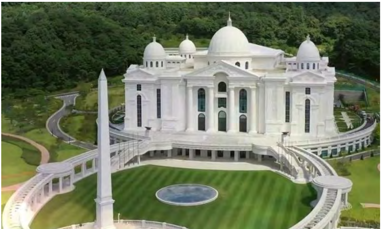
Cheonwon Goong starting to take shape. Here, in August 2024

She should have devoted herself to setting up the environment wherein Jesus could be welcomed, in which he could become the Savior and True Parent of humanity. However, Mary could not fulfill that responsibility.