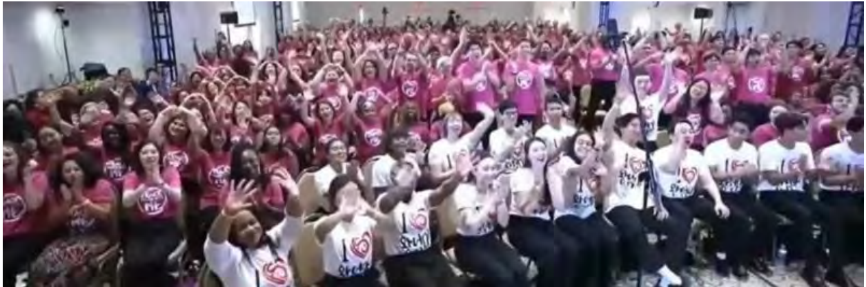
From the large gathering in Han Hwa Temple in Las Vegas 19th January 2025

The second reason is that until now, there was no "true person" who could truly reveal the truth of history.