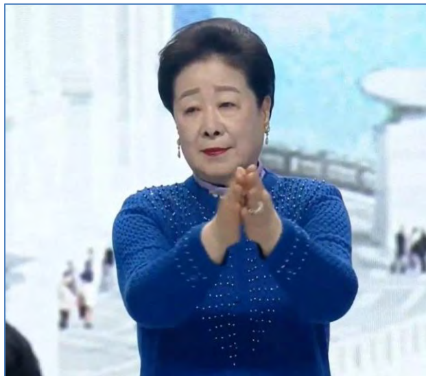
Mother Han , Hak Ja Han , at the global worship service in Gapyeong, South Korea, February 2, 2025