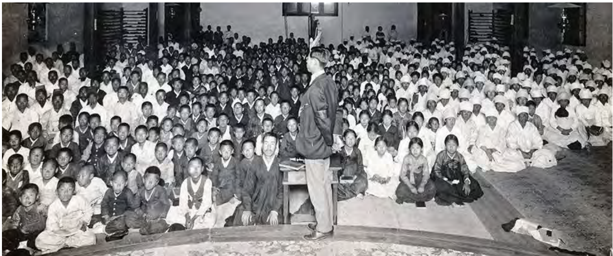
From revival with the Holy Spirit in Korea at the beginning of the 20th Century. Here, a regular weekly prayer meeting in Pyongyang sometimes between 1908-1922.

The birth of the Only Begotten Daughter had to take place in a Christian environment.