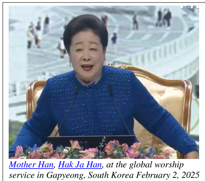
Mother Han, Hak Ja Han, at the global worship service in Gapyeong, South Korea February 2, 2025

However, Korea fell into crisis at that time. How was it that troops from at least 16 UN member states took part and shed righteous blood in that conflict in a small, unknown country? It is because Heaven was with us and protected the Only Begotten Daughter .