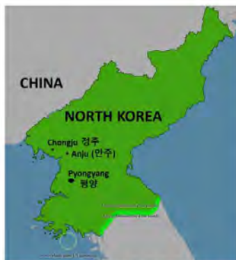
North Korea. Public domain image. Cropped

Dr. Hak Ja Han was born on 10 th February 1943 (6th day of the first month according to the Oriental lunar calendar) in the village of Shineui in the district of Anju in present day North Korea. Her parents were committed Christians. She became an only child because her parents were separated due to political unrest.