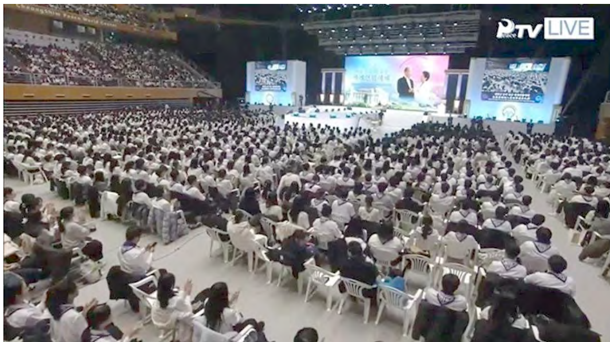
Mother Han , Hak Ja Han , speaking at the global worship service in Gapyeong, South Korea, February 2, 2025

As part of the celebrations of the joint birthday of Father Moon and Mother Han , a "Global Worship Service" was held at the Cheongshim Peace World Center, a large indoor arena in Gapyeong, South Korea on 2nd February 2025. This was a major event in the weeklong celebration as Hak Ja Han turns 82. Sun Myung Moon would have been 105. According to the oriental lunar calendar, their birthdays both are the sixth day of the first month, which this year falls on 3rd February.