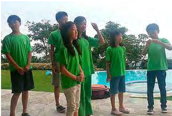
On June 17, 2013, after a short break, the grandchildren report their workshop experiences to True Mother.

True Mother visited South Point in Kona, Hawaii with her grandchildren and staff. South Point is the southernmost part of United States and famous for its strong ocean currents and wind.