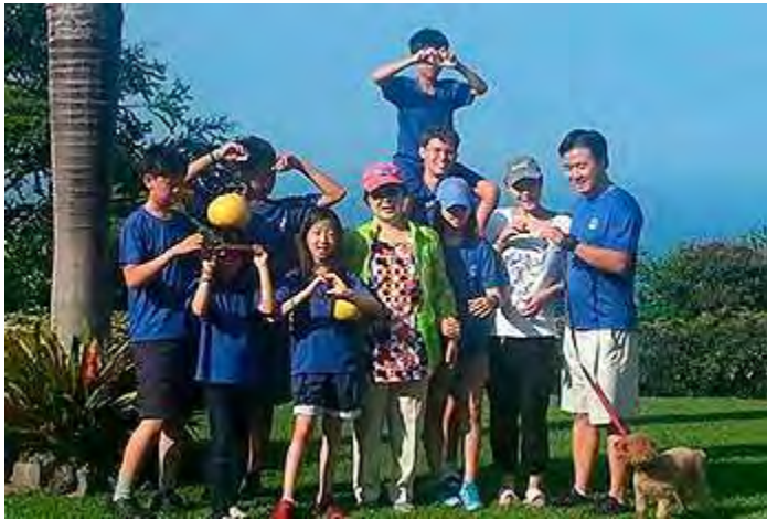
Group photo with True Mother and her family together with a second-generation Kona member at Kona Garden

The workshop's morning Hoon Dok Hwe began with the reading from the Cheon Seong Gyeong and singing of the Cheon Il Guk anthem. Most of the workshop was prepared in Korean, but there were also 23 English Divine Principle lectures [scheduled]. The Korean, Japanese and American second-generation Unificationists served as lecturers for this workshop and prepared fun, engaging lectures.