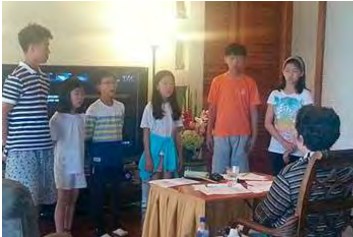
The grandchildren sing for their grandmother, True Mother. June 16, 2013

4. "The reason True Mother came to Kona was to educate her third-generation in Divine Principle."