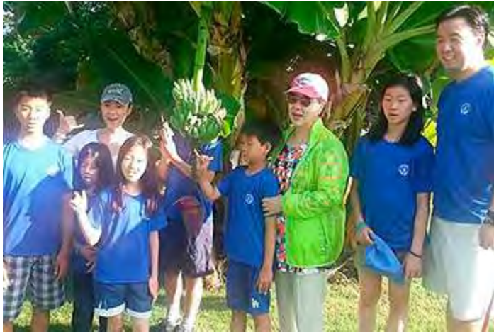
True Mother and her family tried their hand at banana picking and took a family photo.