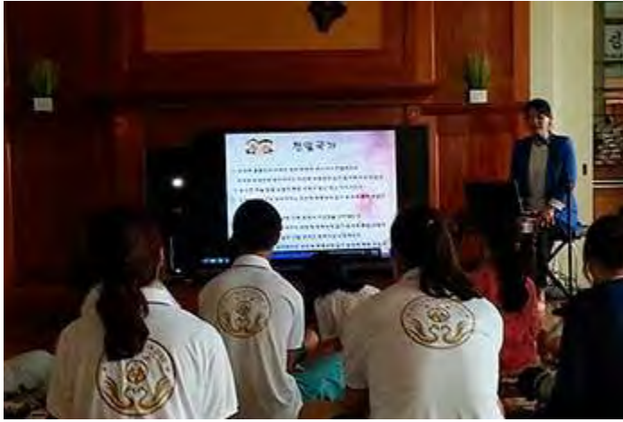
The True Mother's grandchildren, wearing the white shirts, participate in the morning Hoon Dok Hae.

4. "The reason True Mother came to Kona was to educate her third-generation in Divine Principle."