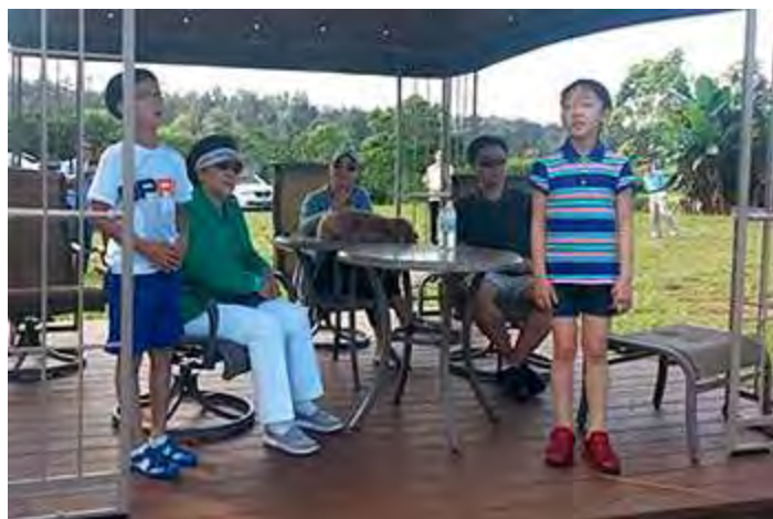
True Grandchildren sing for True Mother

True Mother and her grandchildren safely arrived in Honolulu around 11:00 a.m. and had lunch in a downtown fast food restaurant and left for Kona at 4:30 p.m. When True Mother arrived at Kona, many Hawaiian Family Church members and young second-generation Unificationists welcomed her and some of the young True Grandchildren at the airport. It was a long journey but everyone was in high spirits. After True Mother arrived at King Garden, 30 members gathered and welcomed True Mother. She gave a short message: